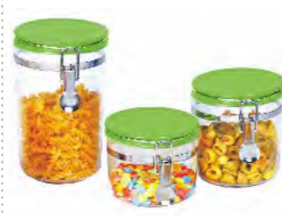
ART NO:H804 3 PIECES VACUUM CANISTER MEAS/QTY:68x45x47cm/24set GW/NW:18/14.4kgs 20'/40':4776/9576set