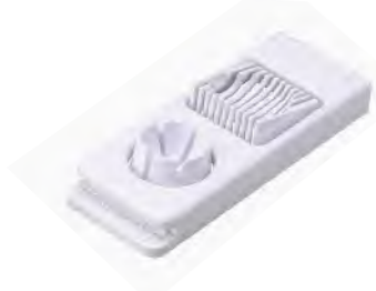
■ ART NO:FF704 EGG/MUSHROOM SLICER&WEDGER MEAS/QTY:61.5x46.5x30cm/96pcs GW/NW:19/17kgs 20'/40':31296/64896pcs