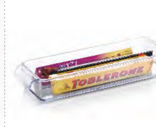
ART NO:S467 FRIDGE STORAGE BOX MEAS/QTY:42.5x31x43cm/36pcs GW/NW:8.5/6.5kgs 20'/40':16380/34560pcs