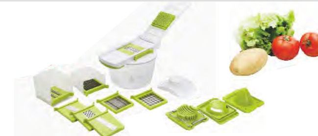
■ ART NO:BF1411 FOOD PROCESSOR MEAS/QTY:57.5x42.5x37cm/8set GW/NW:12.2/11.2kgs 20'/40':2472/5128set