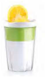
■ ART NO:T446 SLUSHIES & MILK SHAKERS MAKER MEAS/QTY:43.5x33x53cm/36set GW/NW:21/19kgs 20'/40':13320/26640set