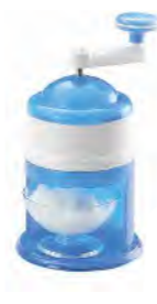
■ ART NO:TF1084 ICE SHAVER MEAS/QTY:63.5x32.5x77cm/24set GW/NW:18/16.5kgs 20'/40':4224/8736set