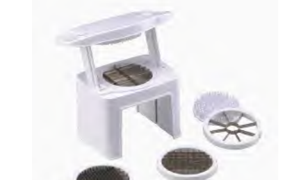
■ ART NO:BF1303 FOOD PROCESSOR MEAS/QTY:44x26x34cm/6set GW/NW: 5.7/4.9kgs 20'/40':4662/9666set