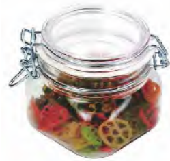
ART NO:H835 PLASTIC JAR(500ML) MEAS/QTY:51x37x41.5cm/60set GW/NW:12.5/11kgs 20'/40':21900/44940set