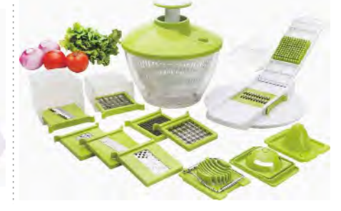
■ ART NO:DF1402 FOOD PROCESSOR MEAS/QTY:69.5x52.5x52cm/8set GW/NW:19/18kgs 20'/40':1176/2440set