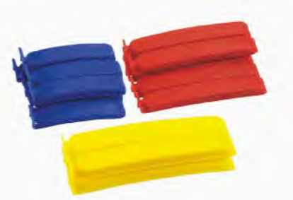
ART NO:L221 VACUUM CLIP(20PCS) MEAS/QTY:54.6x24.3x49.5cm/48set GW/NW:11.1/8.7kgs 20'/40':20544/41088set