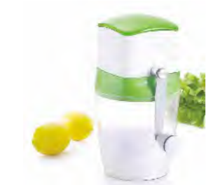
■ ART NO:T509-A ICE CRUSHER MEAS/QTY:43.5x36.5x55cm/12set GW/NW:8.7/6.7kgs 20'/40':3876/7764set