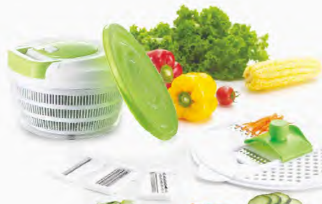
■ ART NO:D660-A SALAD SPINNER SET SIZE:D26xH16.3cm MEAS/QTY:55x36.5x55cm/8set GW/NW:10/7.7kgs 20'/40':1920/4096set