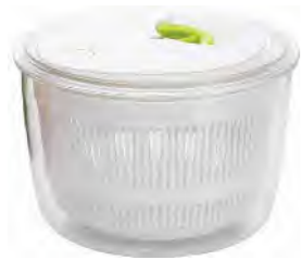
■ ART NO:DF1408-01 SALAD SPINNER MEAS/QTY:63x42.5x30.5cm/12pcs GW/NW:9.6/8.6kgs 20'/40':4104/8520pcs