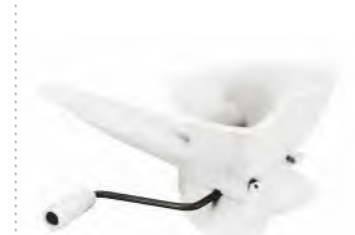
ART NO:BF1025-01 PARSLEY CUTTER MEAS/QTY:53x31x38cm/36set GW/NW:6.5/5.5kgs 20'/40':16128/33480set