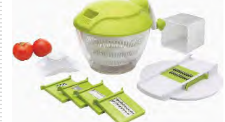
■ ART NO:DF1407-02 FOOD PROCESSOR MEAS/QTY:53.5x53.5x54.5cm/8set GW/NW:14.3/13.3kgs 20'/40':1432/2968set