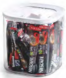
ART NO:S452 FRIDGE STORAGE BOX(2750ML) MEAS/QTY:49.5x33.5x51.5cm/18set GW/NW:8.0/6.0kgs 20'/40':5598/11214pcs