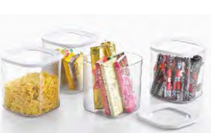
ART NO:Z864 4SETS FRIDGE STORAGE BOX MEAS/QTY:52x33.8x70cm/6set GW/NW:10.1/8.1kgs 20'/40':1308/2622set