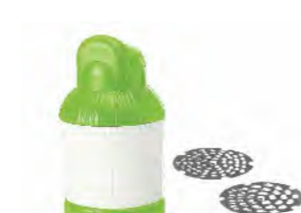
ART NO:B810 MULTI GRATER MEAS/QTY:55.5x37x52.5cm/72pcs GW/NW:16.8/15.3kgs 20'/40':18936/37944pcs