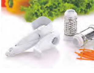
ART NO:B455-A MINI MULTI GRATER MEAS/QTY:45.5x29.5x54.8cm/36set GW/NW:9/7kgs 20'/40':14184/28404set