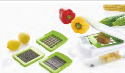
■ ART NO:B413-E MULTI CUTTER MEAS/QTY:59x30x65.5cm/24set GW/NW:19/15kgs 20'/40':6120/11376set