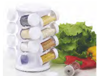
ART NO:H358 16 PCS SPIN SPICE RACK MEAS/QTY:36.5x36.5x55cm/8set GW/NW:12.1/9.6kgs 20'/40':3064/6136set