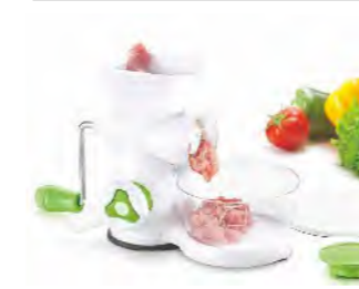
■ ART NO:A465-A MULTI-MILL MEAS/QTY:60.5x47.4x52cm/24set GW/NW:18/16kgs 20'/40':4680/9384set