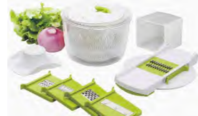
■ ART NO:DF1408-02 FOOD PROCESSOR MEAS/QTY:56.5x43.5x40.5cm/8set GW/NW:10.6/9.6kgs 20'/40':2248/4656set