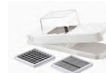
■ ART NO:BF1283 ONION/VEGETABLE DICER AND CUTTER MEAS/QTY:58x33x39cm/24set GW/NW:11/10kgs 20'/40':9000/18648set