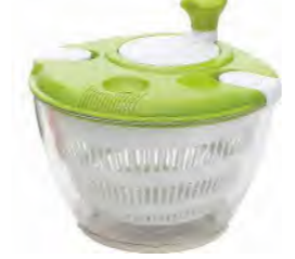
■ ART NO:DF1406-01 SALAD SPINNER MEAS/QTY:51.5x51.5x38.5cm/8pcs GW/NW:7.9/6.9kgs 20'/40':2200/4552pcs