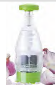
■ ART NO:E819 ONION/VEGETABLE CHOPPER MEAS/QTY:41.5x31.5x54.5cm/24pcs GW/NW:11/8.3kgs 20'/40':9408/18864pcs