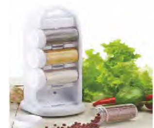
ART NO:H357 8 PCS SPIN SPICE RACK MEAS/QTY:42.5x39.5x60cm/18set GW/NW:15.3/11.8kgs 20'/40':5274/10566set