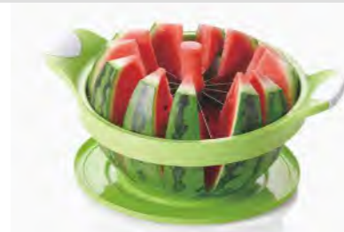
ART NO:B478 MELON CUTTER SIZE:Φ32xH8cm MEAS/QTY:52.3x39x67cm/12set GW/NW:13.3/11.3kgs 20'/40':2436/4884set