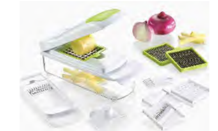
■ ART NO:B427-A MULTI KITCHEN GRATER MEAS/QTY:39.6x32x50cm/12set GW/NW:13.5/12.5kgs 20'/40':5376/10764set