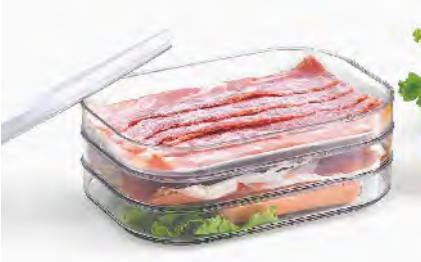
ART NO:S456 FRIDGE STORAGE BOX MEAS/QTY:46.5x33.5x52.5cm/24set GW/NW:13.2/11.2kgs 20'/40':8016/16056set