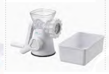
■ ART NO:AF701 SUPER MINCER/PASTE MAKER MEAS/QTY:53.5x42.5x62cm/36set GW/NW:28.5/27kgs 20'/40':7128/14796set