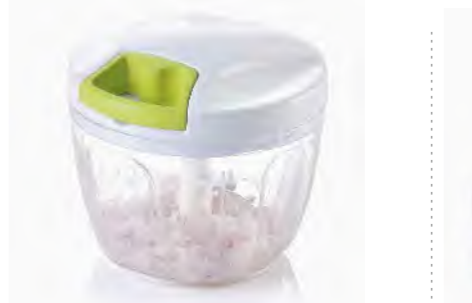
ART NO:A372-A QUICK PULL CHOPPER(650ML) MEAS/QTY:40.5x40.5x53.5cm/36pcs GW/NW:11.7/8kgs 20'/40':11520/23832pcs