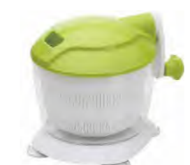
■ ART NO:DF1405-01 RICE CLEANER/SALAD SPINER MEAS/QTY:60x48.5x44.5cm/12pcs GW/NW:12.8/11.8kgs 20'/40':2592/5376pcs