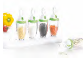
ART NO:H848 5 PIECES SPICE RACK MEAS/QTY:49.5x34.5x44cm/18set GW/NW:10.8/7.5kgs 20'/40':7092/14292set