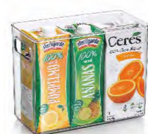
ART NO:S457 FRIDGE STORAGE BOX MEAS/QTY:53.1x27x67.5cm/16pcs GW/NW:9.5/7.4kgs 20'/40':4824/10008pcs