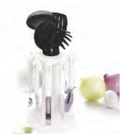
ART NO:X414 22PCS KITCHEN TOOLS SET MEAS/QTY:52x35x62.5cm/12pcs GW/NW:15/13.5kgs 20'/40':2928/5856set