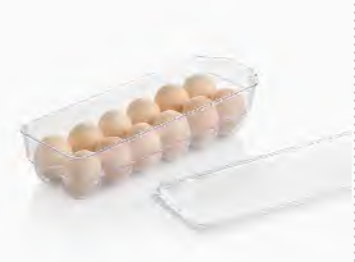
ART NO:S461 FRIDGE EGG TRAY(12pcs) MEAS/QTY:47.5x33.5x48cm/24set GW/NW:9.7/7.7kgs 20'/40':8640/17304set