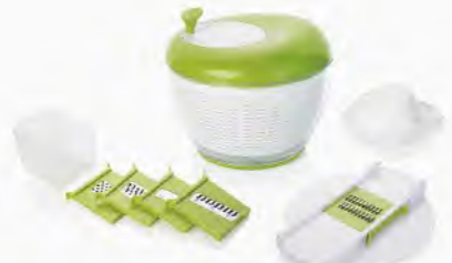
■ ART NO:DF1420-02 FOOD PROCESSOR MEAS/QTY:50.5x28.5x63.7cm/6set GW/NW:10/7.7kgs 20'/40':1818/3642set