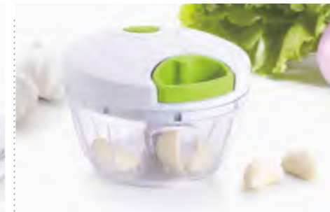
ART NO:A356 MINI SLICER MEAS/QTY:53.8x31x41cm/36pcs GW/NW:10.2/7.1kgs 20'/40':14688/29412pcs