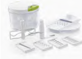
■ ART NO:AF1424 SALAD MAKER MEAS/QTY:52.5x35.5x62cm/18set GW/NW:14/13kgs 20'/40':4356/9036set