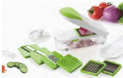
■ ART NO:B408-C MULTI KITCHEN SET MEAS/QTY:57x37.5x51.5cm/24set GW/NW:23.5/19.3kgs 20'/40':6312/12648set