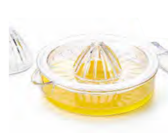
■ ART NO:C459 JUICE EXTRACTOR MEAS/QTY:53.5x33x58.5cm/36set GW/NW:10/8.2kgs 20'/40':9540/19116set