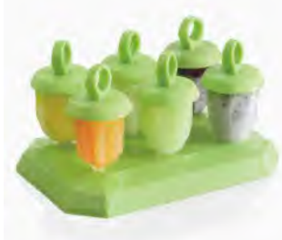
■ ART NO:T150 6PCS GROOVY POPSICLE MAKER MEAS/QTY:51.5x36.5x65.5cm/48set GW/NW:9.0/4.5kgs 20'/40':10080/22176set