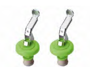
■ ART NO:J523 WINE STOPPER MEAS/QTY:42x31.5x46.5cm/160pcs GW/NW:4/2kgs 20'/40':72960/150720pcs