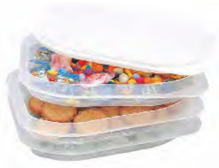
ART NO:S940 3PCS MICROWAVE STORAGE BOX MEAS/QTY:52x50x53.5cm/24pcs GW/NW:12.5/10.5kgs 20'/40':4992/10008set