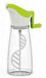
■ ART NO:U962 SALAD DRESSING MEAS/QTY:51.2x26x47cm/36set GW/NW:9.2/5.7kgs 20'/40':15804/31644set