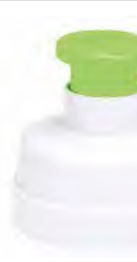
■ ART NO:A816 HAMBURGER MAKER MEAS/QTY:43x32.5x39.5cm/36pcs GW/NW:6.9/4.1kgs 20'/40':17604/35244pcs