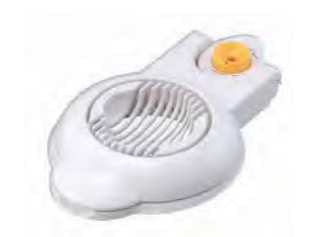
■ ART NO:FF1040 EGG/MUSHROOM SLICER W/PIERCER MEAS/QTY:45.5x35.5x56.5cm/96pcs GW/NW:7.8/6.8kgs 20'/40':29472/61056pcs