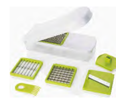
■ ART NO:BF1282-01 ONION/VEGETABLE DICER AND CUTTER MEAS/QTY:58x25.5x51.5cm/24set GW/NW:12/10.5kgs 20'/40':8808/18264set