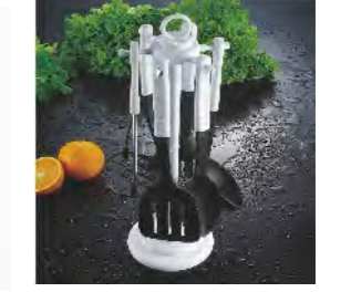
ART NO:X449 KITCHEN TOOLS WITH TABLE STAND MEAS/QTY:49x41.5x51.5cm/24set GW/NW:12/11kgs 20'/40':6696/13608set