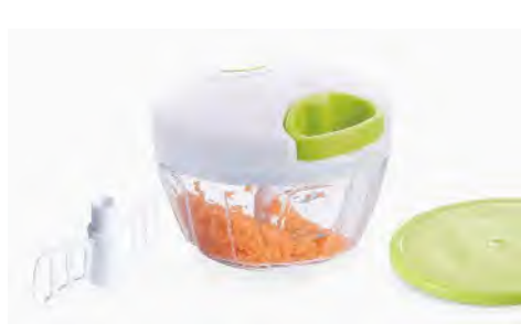
ART NO:A363-C MINI SLICER MEAS/QTY:53.8x31x41cm/36set GW/NW:10.6/8.2kgs 20'/40':14688/29412set