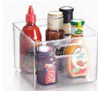
ART NO:S459 FRIDGE STORAGE BOX MEAS/QTY:42.5x42.5x58cm/16pcs GW/NW:7.7/5.7kgs 20'/40':4160/8640pcs