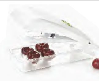
ART NO:Y526 CHERRY&GRAPE CORER MEAS/QTY:62.4x34.3x41cm/72set GW/NW:15.9/13.9kgs 20'/40':19440/38880set