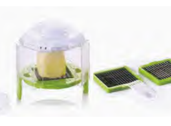
■ ART NO:A362-B 3-IN-1 CHOPPER MEAS/QTY:48x32.5x34cm/12set GW/NW:9.9/7.9kgs 20'/40':6624/13260set