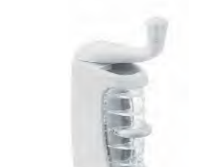
ART NO:BF1152 MINI GRATER MEAS/QTY:48.5x25.5x34cm/60set GW/NW:12.8/11.5kgs 20'/40':40380/83640set