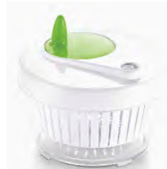
ART NO:D882-B SALAD SPINNER SIZE:Φ15.7xH14.2cm MEAS/QTY:49x33x35.5cm/18pcs GW/NW:7/4.3kgs 20'/40':8928/17874pcs