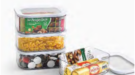
ART NO:Z866 4SETS FRIDGE STORAGE BOX MEAS/QTY:48x33.8x75cm/8set GW/NW:11.7/9.7kgs 20'/40':1864/3736set