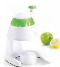
■ ART NO:T208 ICE CRUSHER MEAS/QTY:61.5x40.5x55cm/18set GW/NW:13.4/9.2kgs 20'/40':3654/7326set