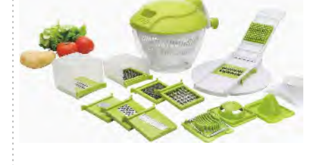
■ ART NO:DF1407 FOOD PROCESSOR MEAS/QTY:61.5x52.5x54.5cm/8set GW/NW:19/18kgs 20'/40':1280/2640set