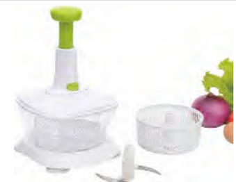
■ ART NO:AF1418-04 SALAD MAKER MEAS/QTY:61.5x43.5x42.5cm/12set GW/NW:10.4/7.2kgs 20'/40':2955/6121set