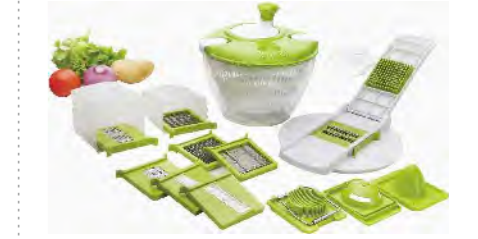
■ ART NO:DF1406 FOOD PROCESSOR MEAS/QTY:59.5x52.5x46.5cm/8set GW/NW:16.3/15.3kgs 20'/40':1544/3200set