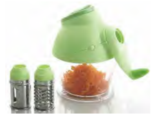
ART NO:B957 3 IN 1 MULTI GRATER MEAS/QTY:55.5x42x49cm/36set GW/NW:14.8/10.6kgs 20'/40':8748/17532set