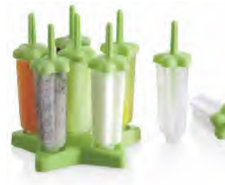
■ ART NO:T155 6PCS GROOVY POPSICLE MAKER MEAS/QTY:43.8x31.5x50.5cm/24set GW/NW:6.7/4.3kgs 20'/40':9240/19320set