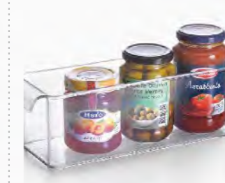
ART NO:S462 FRIDGE STORAGE BOX MEAS/QTY:31.5x31x60cm/18pcs GW/NW:7.0/5.0kgs 20'/40':8316/17136pcs