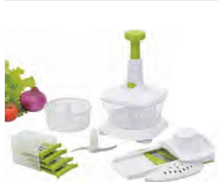
■ ART NO:AF1418-01 SALAD MAKER MEAS/QTY:63x29x47.8cm/6set GW/NW:9.5/8.5kgs 20'/40':1920/3900set