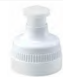
■ ART NO:AF1272 HAMBURG MAKER MEAS/QTY:43.5x33x39.5cm/36pcs GW/NW:7.5/6.5kgs 20'/40':17748/36792pcs