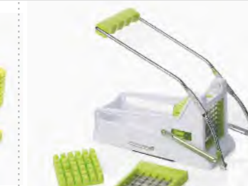
■ ART NO:B835 POTATO/VEGETABLE CHIPPER MEAS/QTY:54.4x36x46.5cm/12set GW/NW:13.8/10.8kgs 20'/40':3588/7188set