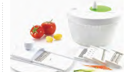
ART NO:D886-A MINI-FUNCTIONAL SALAD SPINNER SIZE:Φ19xH15.5cm MEAS/QTY:60x40x54.5cm/18set GW/NW:7/5.5kgs 20'/40':3870/7758set