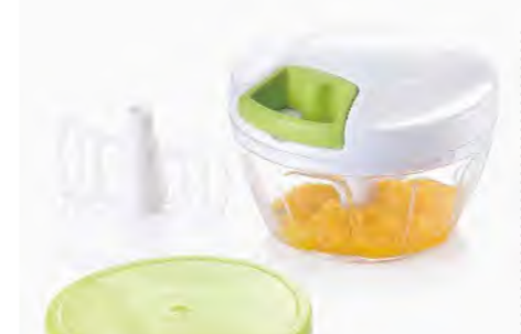
ART NO:A372 QUICK PULL CHOPPER(400ML) MEAS/QTY:53.8x31x41cm/36pcs GW/NW:10.6/8.2kgs 20'/40':14688/29412pcs