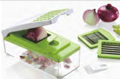
■ ART NO:B428 MULTI-SLICER MEAS/QTY:48.7x36x57cm/24set GW/NW:20.8/18kgs 20'/40':7176/14376set