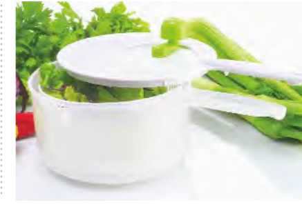
ART NO:D651 SALAD SPINNER SIZE:Φ18.5xH14.6cm MEAS/QTY:60x33.5x59cm/12pcs GW/NW:6/4kgs 20'/40':3024/6720pcs