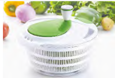
ART NO:D668 SALAD SPINNER MEAS/QTY:50.5x31.5x76cm/12pcs GW/NW:9.4/7.4kgs 20'/40':2760/5532pcs