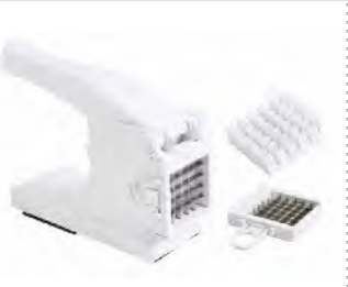
■ ART NO:B959-A POTATO CHIPPER WITH CUPULE (2PCS BLADES) MEAS/QTY:45x38.5x56cm/24set GW/NW:16/12.4kgs 20'/40':7200/14400set