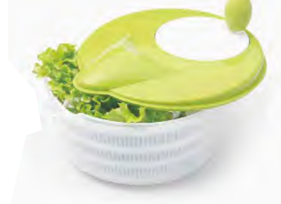
■ ART NO:DF1056 SALAD SPINNER MEAS/QTY:51x51x58cm/12pcs GW/NW:17.6/16.6kgs 20'/40':1980/4116pcs