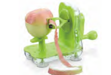
ART NO:G375 APPLE PEELER MEAS/QTY:57.3x27.3x58cm/18set GW/NW:10/6.9kgs 20'/40':5598/11214set