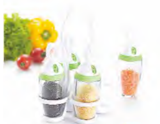
ART NO:H252 CONDIMENT SET OF 4 MEAS/QTY:57.5x41.34x47.5cm/24set GW/NW:12/9.3kgs 20'/40':6120/12264set