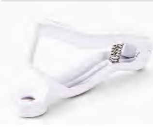
ART NO:Y524 CHERRY/OLIVE PITTER MEAS/QTY:42x22x30.5cm/80pcs GW/NW:4.8/2.8kgs 20'/40':81520/163120pcs