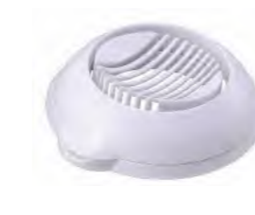
■ ART NO:FF1039-01 MINI EGG SLICER MEAS/QTY:51.5x25x49cm/96pcs GW/NW: 20'/40':42528/88224pcs