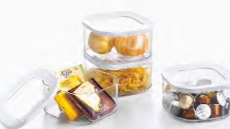
ART NO:Z865 4SETS FRIDGE STORAGE BOX MEAS/QTY:52x33.8x75cm/12set GW/NW:12.5/10.5kgs 20'/40':2616/5244set