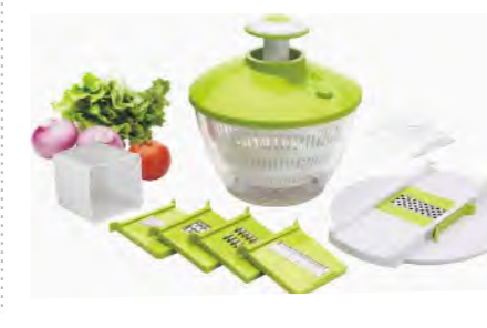
■ ART NO:DF1402-02 FOOD PROCESSOR MEAS/QTY:53.5x53.5x45cm/8set GW/NW:13.8/12.8kgs 20'/40':1736/3600set