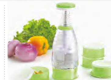
■ ART NO:E938-B MULTI VEGETABLE CHOPPER MEAS/QTY:49.5x30x64cm/12set GW/NW:11/7.1kgs 20'/40':3528/7320set