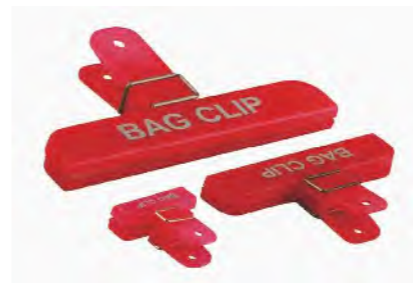
ART NO:L030 BAG CLIP(3PCS) MEAS/QTY:47x45x32.7cm/72set GW/NW:7.5/5.5kgs 20'/40':30168/60408set