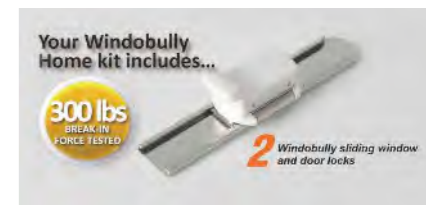
ART NO:Y995-D WINDOBULLY 2 PACK MEAS/QTY:27.5x24.5x39.2cm/24set GW/NW:5.9/3.9kgs 20'/40':12672/26112set