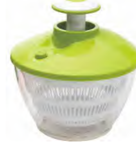
■ ART NO:DF1402-01 SALAD SPINNER MEAS/QTY:52.5x52.5x45cm/8pcs GW/NW:10/9kgs 20'/40':1800/3736pcs