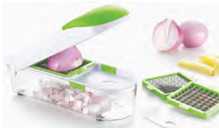
■ ART NO:B408 MULTI-SLICER MEAS/QTY:47.5x30x58cm/24set GW/NW:18.2/15kgs 20'/40':8712/17448set