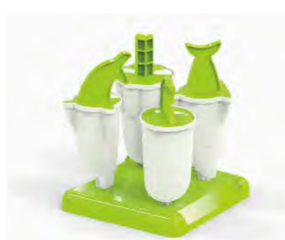
■ ART NO:T157 4 PCS POPSICLE MAKER MEAS/QTY:60x45x53cm/36set GW/NW:9.9/5.1kgs 20'/40':7128/14760set