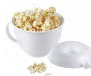
ART NO:X334 POPCORN MAKER MEAS/QTY:45.5x30.7x45.8cm/18pcs GW/NW:4.7/2.4kgs 20'/40':8100/16218set