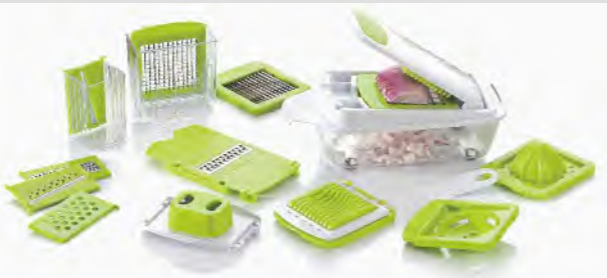
■ ART NO:B413 MULTI KITCHEN HELPER MEAS/QTY:50.7x29.9x57.7cm/12set GW/NW:15.8/13.8kgs 20'/40':3696/7728set