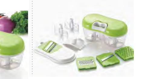
ART NO:A383 TWIN VEGETABLE CHOPPER AND BLENDER MEAS/QTY:54.5x43x40cm/18set GW/NW:11.9/9kgs 20'/40':5022/10062set