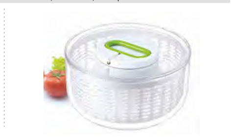
ART NO:D652 SALAD SPINNER SIZE:Φ20.3xH12cm MEAS/QTY:62.5x42.5x41.5cm/18pcs GW/NW:14.6/10.4kgs 20'/40':4572/9162pcs