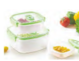
ART NO:S451 VACUUM CONTAINER MEAS/QTY:44.5x41.5x63.5cm/24pcs GW/NW:16/12.6kgs 20'/40':5976/11976set