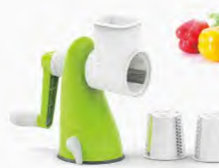
ART NO:B452-B 3PCS ROTARY GRATER MEAS/QTY:56x27.2x62cm/12set GW/NW:12.4/9.2kgs 20'/40':3732/7476set