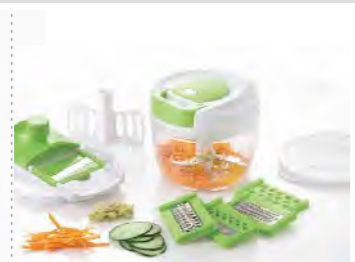
ART NO:A369-A QUICK PULL CHOPPER SET MEAS/QTY:43.5x36.5x48.5cm/18set GW/NW:11.6/9.0kgs 20'/40':6588/13572set