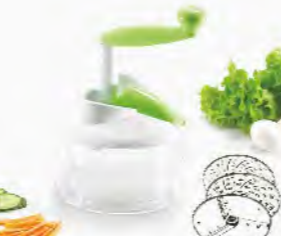
ART NO:B456-A MULTI-GRATER (3PCS BLADES INCLUDED) MEAS/QTY:41x41x50cm/12set GW/NW:9.2/6.5kgs 20'/40':3648/7788set