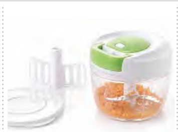
ART NO:A369 QUICK PULL CHOPPER MEAS/QTY:43.5x43.5x54cm/36set GW/NW:15.7/12.3kgs 20'/40':9000/19620set