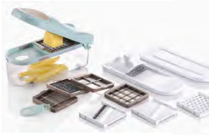
■ ART NO:B460-A MULTI KITCHEN GRATER MEAS/QTY:52.5x30x56.8cm/12set GW/NW:14/11kgs 20'/40':3924/7860set