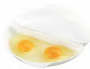
■ ART NO:F288 MICROWAVE OMETLETTE PAN MEAS/QTY:44.5x30.5x74.5cm/60pcs GW/NW:6.8/5.3kgs 20'/40':18000/378000pcs