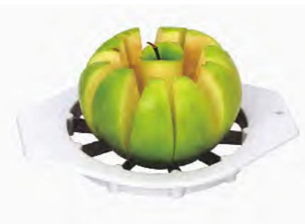
ART NO:B464 APPLE SLICER MEAS/QTY:42x44x70cm/240pcs GW/NW:16/14.5kgs 20'/40':50160/102960pcs