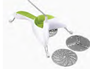
ART NO:BF1001-02 KITCHEN GRATER W/3 BLADES MEAS/QTY:57.5x33.5x22cm/6set GW/NW:4.5/3.5kgs 20'/40':3966/8226set