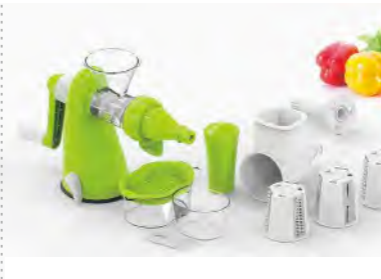
■ ART NO:B452 JUICER GRATER SET MEAS/QTY:51.5x34.5x61cm/8set GW/NW:17.9/15kgs 20'/40':2080/4304set