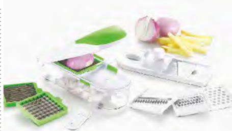
■ ART NO:B408-A MULTI KITCHEN GRATER MEAS/QTY:57.5x37.5x46cm/24set GW/NW:23.7/20.2kgs 20'/40':6888/13800set