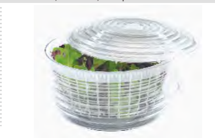
ART NO:D457 SALAD SPINNER SIZE:Φ27xH17cm MEAS/QTY:56x52.5x56.5cm/12pcs GW/NW:16/11.5kgs 20'/40':2144/4288pcs