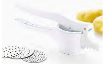
■ ART NO:C390-A POTATO PRESSER MEAS/QTY:48x37.5x60.8cm/24set GW/NW:13.1/8.8kgs 20'/40':6240/12504set