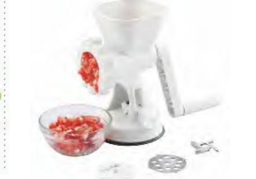
■ ART NO:AF618 SUPER MINCER/PASTE MAKER MEAS/QTY:40.5x34.5x62cm/27set GW/NW:17/16kgs 20'/40':8751/18063set