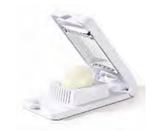
■ ART NO:F928 EGG SLICER MEAS/QTY:64x40.5x42.5cm/144set GW/NW:21/16.7kgs 20'/40':34560/72720set