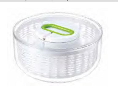
ART NO:D653 SALAD SPINNER SIZE:Φ26xH14cm MEAS/QTY:54.5x27.5x47cm/6pcs GW/NW:7/5.3kgs 20'/40':2394/4794pcs