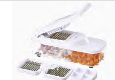
■ ART NO:B410 MULTI KITCHEN GRATER MEAS/QTY:59.5x36x44cm/24set GW/NW:22/18.3kgs 20'/40':6816/14496set