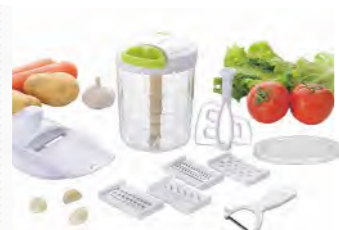
■ ART NO:AF1416 SALAD MAKER MEAS/QTY:61.2x44.4x54.9cm/36set GW/NW:25/24kgs 20'/40':6732/14004set