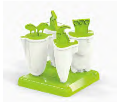
■ ART NO:T158 4 PCS POPSICLE MAKER MEAS/QTY:60x45x53cm/36set GW/NW:9.9/5.1kgs 20'/40':7128/14760set