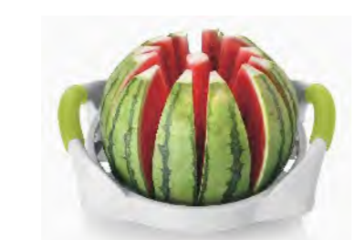
ART NO:B480 MELON CUTTER SIZE:Φ28xH10cm MEAS/QTY:58.2x36.4x63.2cm/12set GW/NW:11/9kgs 20'/40':2580/5172set