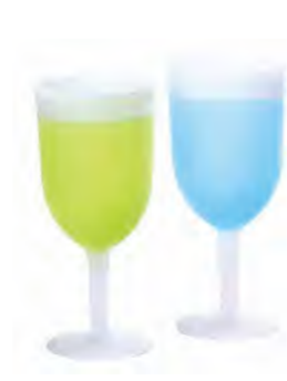
■ ART NO:T440 ICE CUP(400ML) MEAS/QTY:39.5x39.5x62.5cm/48pcs GW/NW:11.8/9.9kgs 20'/40':12096/25056pcs