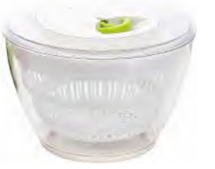
■ ART NO:DF1404-01 SALAD SPINNER MEAS/QTY:51.5x51.5x36cm/8pcs GW/NW:8.7/7.7kgs 20'/40':2344/4856pcs