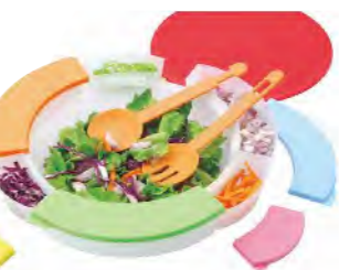
ART NO:R402 15PCS SALAD BOWL MEAS/QTY:48.5x27x40.5cm/8pcs GW/NW:7.5/5.1kgs 20'/40':4216/8440set