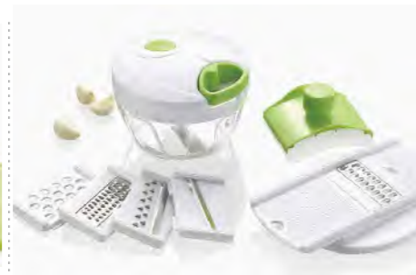
ART NO:A356-A MINI SLICER MEAS/QTY:55.5x45x48cm/36set GW/NW:14.5/12.5kgs 20'/40':8604/17244set