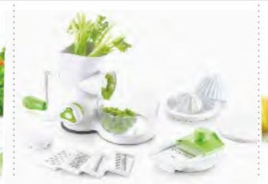
■ ART NO:A465 MULTI-FUNCTIONAL BLENDER AND ADDITIONAL MEAS/QTY:52.5x28.5x60cm/12set GW/NW:14/12kgs 20'/40':3828/7668set