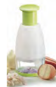
■ ART NO:E904 MINI ONION/VEGETABLE CHOPPER MEAS/QTY:45.8x31x68cm/96pcs GW/NW:18.3/13.7kgs 20'/40':28704/57504pcs