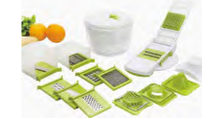
■ ART NO:DF1408 FOOD PROCESSOR MEAS/QTY:60.5x47.5x38.5cm/8set GW/NW:13/12kgs 20'/40':2024/4192set