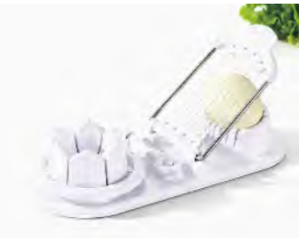
■ ART NO:F822 EGG SLICER MEAS/QTY:66.5x30x27.5cm/48pcs GW/NW:8.5/7.2kgs 20'/40':24480/50400set