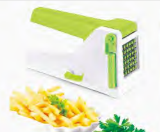
■ ART NO:B821 POTATO CHIPPER MEAS/QTY:43.5x37.5x47cm/18set GW/NW:11.3/8.5kgs 20'/40':6570/13140set