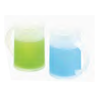
■ ART NO:T439 ICE CUP(230ML) MEAS/QTY:33.5x17.5x35cm/24pcs GW/NW:12.6/10.6kgs 20'/40':29376/59184pcs