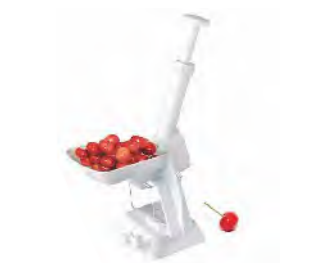
ART NO:Y523 CHERRY&GRAPE CORER MEAS/QTY:39.5x26.5x51.5cm/12set GW/NW:5.6/3.6kgs 20'/40':6336/13248set