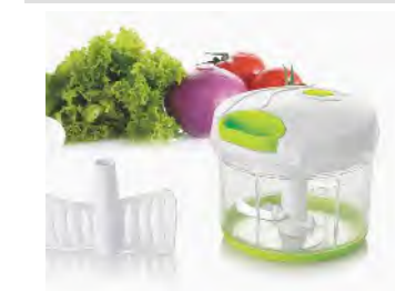
ART NO:A368 SWIFT CHOPPER MEAS/QTY:45x30.5x40.5cm/18set GW/NW:7.4/5.4kgs 20'/40':9522/19062set