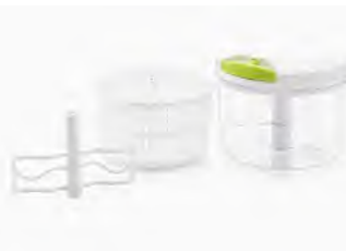
■ ART NO:AF1424-01 SALAD MAKER MEAS/QTY:48x32.5x48.5cm/18pcs GW/NW:11/10kgs 20'/40':6678/13806pcs