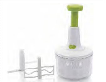
■ ART NO:AF1425-01 SALAD MAKER MEAS/QTY:64x32.5x59cm/24set GW/NW:12.5/11.5kgs 20'/40':5472/12024set