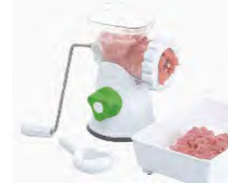
■ ART NO:A460 SUPER MINCER MEAS/QTY:40.5x28x62cm/18set GW/NW:15.2/12.4kgs 20'/40':7326/14670set