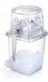
■ ART NO:T819-A TRASPARENT ICE CRUSHER MEAS/QTY:37.5x34x49.5cm/12set GW/NW:8.5/6.3kgs 20'/40':5676/11364set