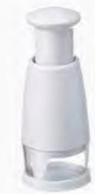
■ ART NO:E903 MINI ONION/VEGETABLE CHOPPER MEAS/QTY:39x26.5x47.5cm/72pcs GW/NW:13/10kgs 20'/40':43992/87984pcs