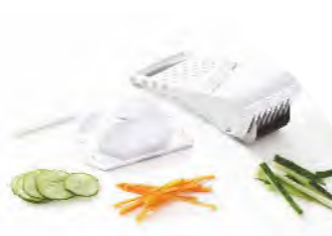
ART NO:B920 MINI MULTI-GRATER MEAS/QTY:37.5x27.5x42cm/24set GW/NW:6.3/5.5kgs 20'/40':16128/31104set