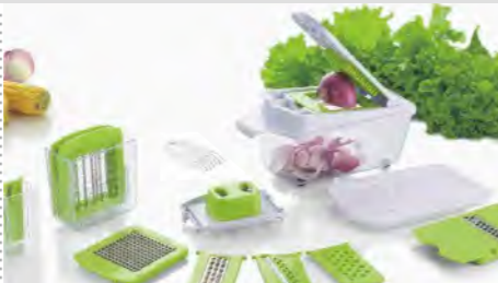
■ ART NO:B436 KITCHEN HELPER MEAS/QTY:39.7x29.3x58.8cm/12set GW/NW:14.4/12.4kgs 20'/40':5172/10356set