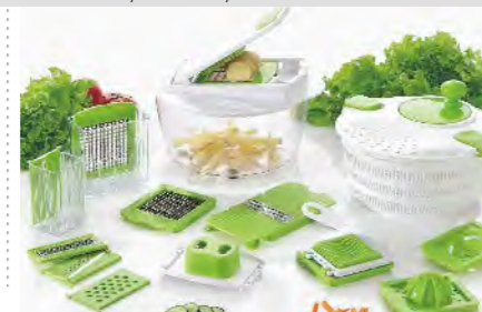
ART NO:D667 MULTI KITCHEN HELPER MEAS/QTY:53.5x27.2x63.5cm/6set GW/NW:11.4/9.4kgs 20'/40':1818/3642set