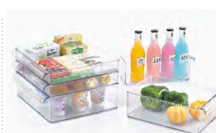
ART NO:Z860 6 PCS FRIDGE STORAGE BOX MEAS/QTY:63x32.3x62.6cm/4set GW/NW:11.6/9.6kgs 20'/40':752/1508set