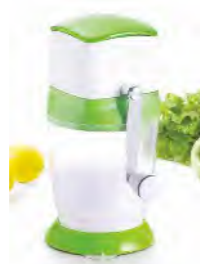
■ ART NO:T509 ICE CRUSHER MEAS/QTY:54x31.5x57.5cm/12set GW/NW:9.2/7.2kgs 20'/40':3540/7092set