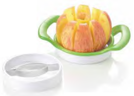
ART NO:B404 APPLE&MANGO SLICER MEAS/QTY:58.5x38.5x53.5cm/72set GW/NW:12/10.8kgs 20'/40':17208/34488set