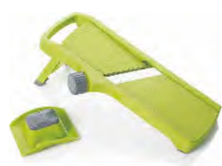
ART NO:BF1430 KITCHEN GRATER MEAS/QTY:41x30.5x30.5cm/4set GW/NW:3/2kgs 20'/40':2936/6080set