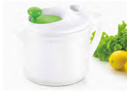
ART NO:D927 SALAD SPINNER SIZE:Φ19.5xH20.5cm MEAS/QTY:40.5x24x55.7cm/6pcs GW/NW:4.5/2.5kgs 20'/40':3210/6426pcs