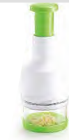
■ ART NO:E462 ONION/VEGETABLE CHOPPER MEAS/QTY:56.5x38x49cm/48pcs GW/NW:15.4/10.1kgs 20'/40':12624/25296pcs