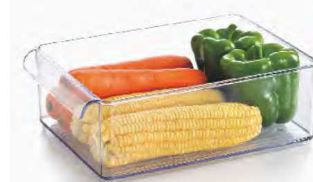
ART NO:S465 FRIDGE STORAGE BOX MEAS/QTY:42.5x31x60.7cm/12pcs GW/NW:7.9/5.8kgs 20'/40':3780/7980pcs