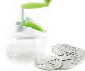
ART NO:B456-B MULTI-GRATER (5PCS BLADES INCLUDED) MEAS/QTY:41x41x50cm/12set GW/NW:9.9/7.2kgs 20'/40':3648/7788set