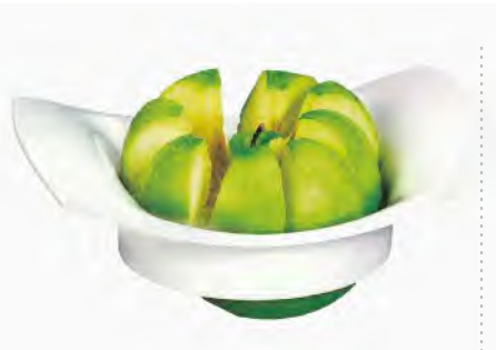
ART NO:B464-A APPLE SLICER MEAS/QTY:68x37x46cm/144pcs GW/NW:13/11kgs 20'/40':34416/68976pcs