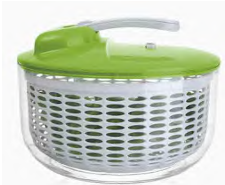
■ ART NO:D659 SALAD SPINNER SIZE:Φ26xH19.5cm MEAS/QTY:54.5x28x51cm/6set GW/NW:7/5.5kgs 20'/40':2178/4458et