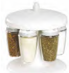
ART NO:H849 6 PIECES SPICE RACK MEAS/QTY:50x33.5x43.8cm/12set GW/NW:10/8kgs 20'/40':4848/9708set