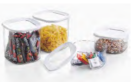
ART NO:Z862 4SETS FRIDGE STORAGE BOX MEAS/QTY:52x33.8x53.6cm/6set GW/NW:8.7/6.7kgs 20'/40':1746/3498set