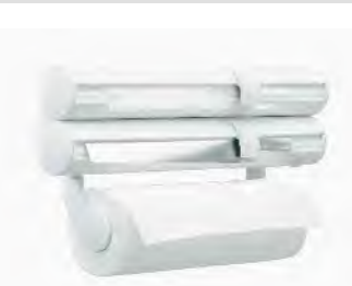
ART NO:K376 WALL MOUNTABLE KITCHEN DISPENSER MEAS/QTY:53.5x42.5x56cm/24set GW/NW:18.5/13.1kgs 20'/40':5352/10728set