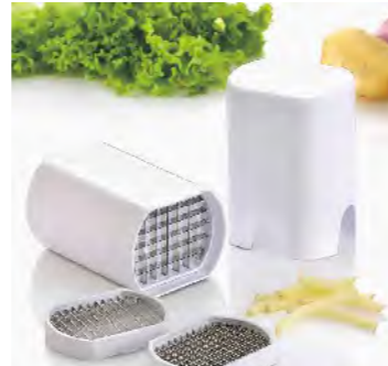
■ ART NO:B201-A POTATO CHIPPER MEAS/QTY:42.7x26.5x57.2cm/48set GW/NW:13/11kgs 20'/40':21648/43344set