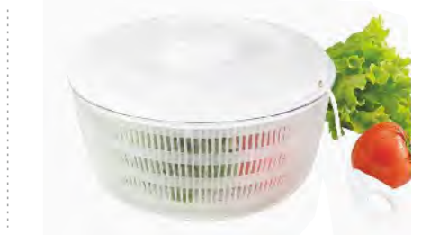
ART NO:D403 SALAD SPINNER SIZE:Φ24.5xH15cm MEAS/QTY:49.7x26x58cm/8pcs GW/NW:10/8kgs 20'/40':3160/6224pcs