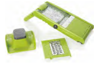
ART NO:BF1431 KITCHEN GRATER MEAS/QTY:27.5x21x19.5cm/12set GW/NW:3/2kgs 20'/40':29760/61680set