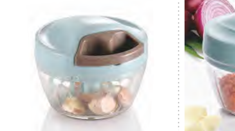
ART NO:A392 GARLIC PEELE(400ML) MEAS/QTY:45.7x27.5x41cm/24pcs GW/NW:7.5/4.6kgs 20'/40':13440/26880pcs