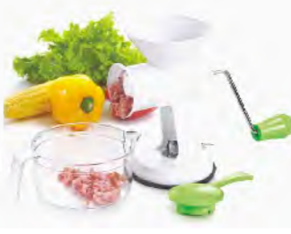
■ ART NO:A462 MULTI-MILL MEAS/QTY:53x43x47cm/18set GW/NW:16/14kgs 20'/40':4698/9414set