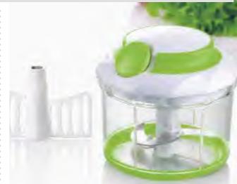
ART NO:A362-A SWIFT CHOPPER MEAS/QTY:45x30.5x59.2cm/24set GW/NW:11.3/9.3kgs 20'/40':8376/16776set