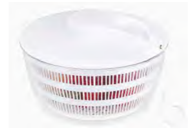
ART NO:D420-A SALAD SPINNER SIZE:Φ24xH14.5cm MEAS/QTY:50.3x26x58cm/8pcs GW/NW:6.5/4.7kgs 20'/40':3160/6328pcs