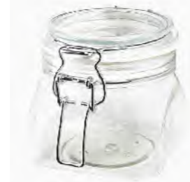
ART NO:H834 PLASTIC JAR(500ML) MEAS/QTY:41.5x31.5x48.5cm/60set GW/NW:12.7/11.3kgs 20'/40':27600/55200set