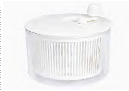
ART NO:D261 SALAD SPINNER SIZE:Φ19xH13.5cm MEAS/QTY:40.1x40.1x48cm/12pcs GW/NW:6/4.6kgs 20'/40':4188/8808pcs