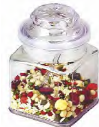
ART NO:H104 PLASTIC JAR MEAS/QTY:31.5x23x28.7cm/36pcs GW/NW:3.5/2.5kgs 20'/40':50652/101340pcs