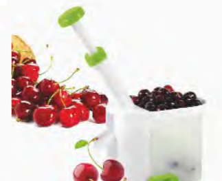
ART NO:Y522 CHERRY&GRAPE CORER MEAS/QTY:43x38.5x47.5cm/12set GW/NW:6.3/3.6kgs 20'/40':4452/9060set