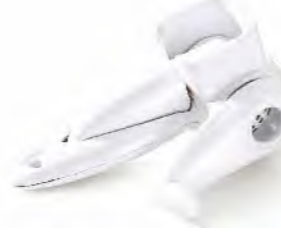
ART NO:B455 MINI MULTI GRATER MEAS/QTY:45.5x29.5x54.8cm/36set GW/NW:8.2/5.1kgs 20'/40':14184/28404set