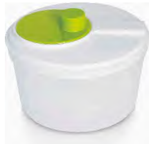
■ ART NO:DF1008 SALAD SPIN DRIER MEAS/QTY:51x42.7x43.5cm/16pcs GW/NW:9/8kgs 20'/40':4720/9792pcs