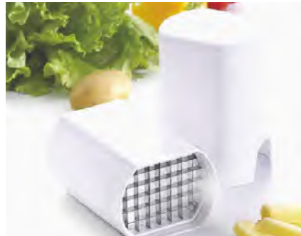
■ ART NO:B201 POTATO CHIPPER MEAS/QTY:42.7x26.5x57.2cm/48set GW/NW:12.9/9.4kgs 20'/40':21648/43344set