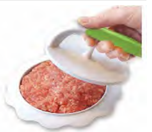
■ ART NO:A817 PERFECT BURGER PRESSER MEAS/QTY:66x45.2x50cm/72pcs GW/NW:20.1/13.5kgs 20'/40':13608/27288pcs