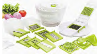
■ ART NO:DF1404 FOOD PROCESSOR MEAS/QTY:61.5x52x51cm/8set GW/NW:17.8/16.8kgs 20'/40':1368/2840set