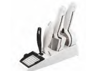
■ ART NO:BF1328 ONION/VEGETABLE DICER AND CUTTER MEAS/QTY:40x26.5x40cm/12pcs GW/NW:7.5/6.5kgs 20'/40':7920/16404pcs