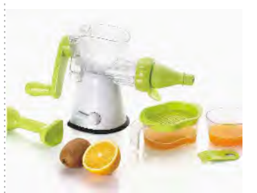
■ ART NO:A618 JUICER MAKER MEAS/QTY:55.5x28.5x63cm/12set GW/NW:17.8/15.8kgs 20'/40':3540/7082set