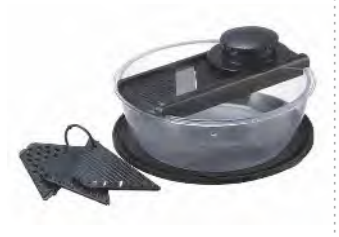
ART NO:BF1080 KITCHEN GRATER W/PS CONTAINER MEAS/QTY:55x28x57cm/10set GW/NW:11/9.5kgs 20'/40':3190/6610set