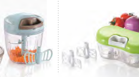
ART NO:A391-C QUICK PULL CHOPPER(900ML) MEAS/QTY:53.8x27.5x57cm/24set GW/NW:13.6/9.6kgs 20'/40':7656/15336set