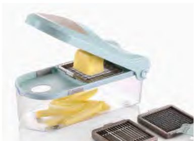
■ ART NO:B460 MULTI-SLICER MEAS/QTY:37.5x29.2x48.5cm/12set GW/NW:9.5/7.3kgs 20'/40':6468/12948set