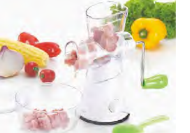
■ ART NO:A468 MULTI MINCER MEAS/QTY:61.5x49x51.5cm/24set GW/NW:18/16.5kgs 20'/40':4440/9000set