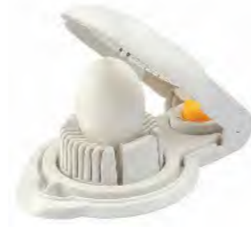
■ ART NO:FF1039 EGG/MUSHROOM SLICER& WEDGER W/PIERCER MEAS/QTY:47.5x30.5x54cm/96set GW/NW:19/17.5kgs 20'/40':34272/71136set