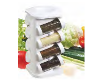
ART NO:H354 8 PCS SPIN SPICE RACK MEAS/QTY:51.5x39x57cm/24set GW/NW:20/16.2kgs 20'/40':6312/12648set