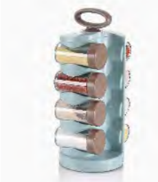
ART NO:H389 8 PCS SPIN SPICE RACK MEAS/QTY:42.3x42.3x56.6cm/18set GW/NW:15.5/12.2kgs 20'/40':4915/10206set