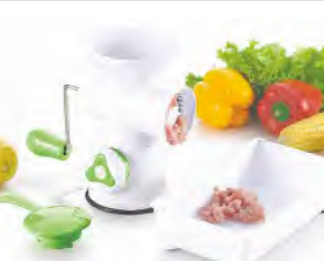
■ ART NO:A461 MULTI-MILL MEAS/QTY:52.1x43.5x41.3cm/18set GW/NW:15.5/13.5kgs 20'/40':5364/10926set