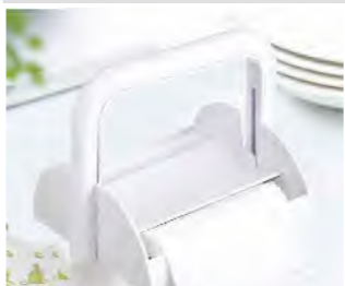
ART NO:K828 HANY PAPER HOLDER MEAS/QTY:54.5x33x57.5cm/24set GW/NW:12/8.0kgs 20'/40':6696/13416set