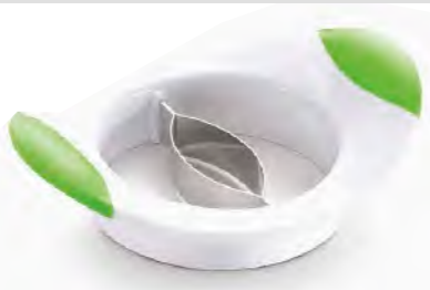
ART NO:B431 MANGO SLICER SIZE:ΦL16xW12.5xH4.4cm MEAS/QTY:53x27x51cm/60set GW/NW:10.2/6.2kgs 20'/40':22740/45540set