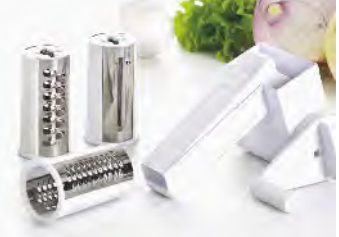
ART NO:B423 MINI MULTI GRATER MEAS/QTY:51.2x29x61cm/72set GW/NW:15.5/10.9kgs 20'/40':22968/46008set