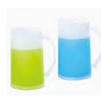
■ ART NO:T441 ICE CUP(460ML) MEAS/QTY:48.5x20x49.5cm/24pcs GW/NW:10/9kgs 20'/40':13056/27648pcs