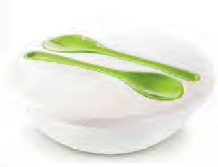
ART NO:R664 SALAD BOWL MEAS/QTY:54x29x65cm/12set GW/NW:5.7/4.4kgs 20'/40':3252/6516set