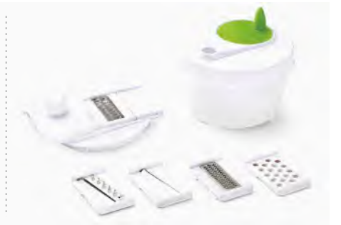
ART NO:D882-A MINI MULTI-FUNCTIONAL SALAD SPINNER SIZE:Φ15.7xH14.2cm MEAS/QTY:46.5x42.5x53.6cm/18set GW/NW:7/5.5kgs 20'/40':4752/9612set