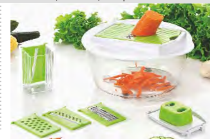
ART NO:D667-D MULTI KITCHEN GRATER MEAS/QTY:53.9x27.5x45cm/6set GW/NW:4.7/2.7kgs 20'/40':2640/5280set