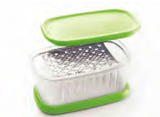
ART NO:B866 GRATER WITH CONTAINER MEAS/QTY:36.7x27.8x48cm/24set GW/NW:9/6.9kgs 20'/40':14568/29160set