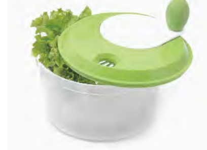
■ ART NO:DF1008-01 SALAD SPINNER MEAS/QTY:43x43x44cm/12pcs GW/NW:5.5/4kgs 20'/40':4128/8544pcs