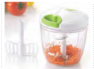
ART NO:A370 QUICK PULL CHOPPER MEAS/QTY:53.5x40x45.5cm/36pcs GW/NW:13.2/9.9kgs 20'/40':10440/22320pcs