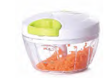
ART NO:A363-B MINI SLICER MEAS/QTY:53.8x31x41cm/36pcs GW/NW:10.2/7.1kgs 20'/40':14688/29412pcs