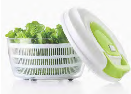
■ ART NO:D660 SALAD SPINNER SIZE:D25xH16.3cm MEAS/QTY:51.5x36.5x52cm/8pcs GW/NW:7.8/5.6kgs 20'/40':2112/4352pcs