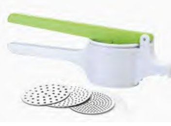
■ ART NO:C390 POTATO PRESSER MEAS/QTY:45.5x36.7x57.7cm/24set GW/NW:12/10.5kgs 20'/40':7176/14376set