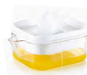
■ ART NO:C614 JUICE EXTRACTOR MEAS/QTY:58x32.7x42.8cm/48set GW/NW:8.9/6kgs 20'/40':17232/34512set