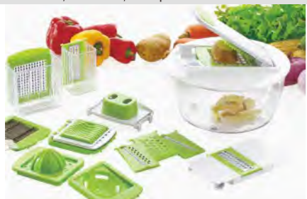
ART NO:D667-E MULTI KITCHEN HELPER MEAS/QTY:53.5x27.2x46.5cm/6set GW/NW:9/7kgs 20'/40':2640/5280set