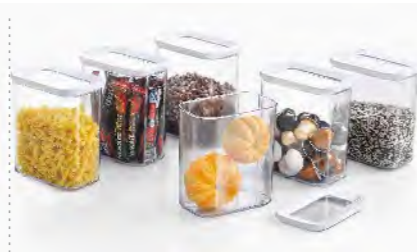
ART NO:Z863 6SETS FRIDGE STORAGE BOX MEAS/QTY:57x32x70cm/8set GW/NW:12.6/10.6kgs 20'/40':1784/3576set