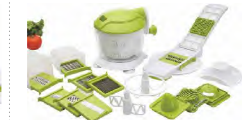
■ ART NO:DF1405 FOOD PROCESSOR MEAS/QTY:64.5x48.5x45cm/8set GW/NW:17.9/16.9kgs 20'/40':1592/3296set