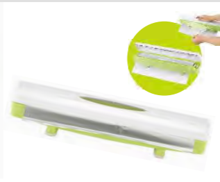
ART NO:KF1371 PAPER TOWEL BOX MEAS/QTY:38x37.8x57.5cm/24set GW/NW:9.6/10.6kgs 20'/40':8136/16848set