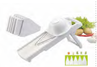
ART NO:BF1311 JUMBO GRATER MEAS/QTY:41x30.5x30.5cm/4set GW/NW:3/2kgs 20'/40':2936/6080set