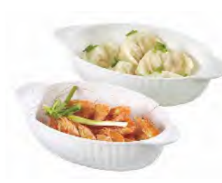
ART NO:S981 MICROWAVE BOX(2pcs/set) MEAS/QTY:41.5x32.5x50cm/24pcs GW/NW:6.2/3.8kgs 20'/40':10056/21000set