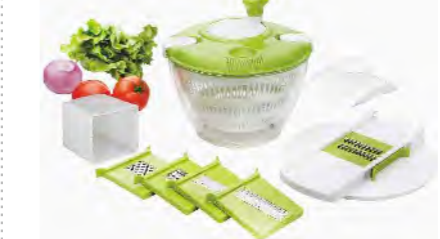
■ ART NO:DF1406-02 FOOD PROCESSOR MEAS/QTY:53.5x52.5x46.5cm/8set GW/NW:11.9/10.9kgs 20'/40':1712/3552set