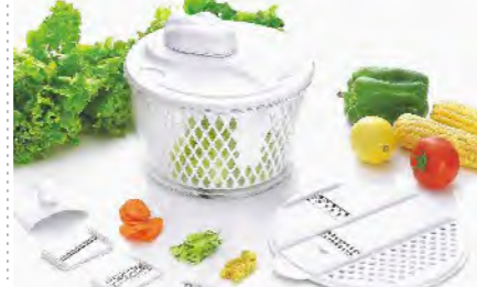
ART NO:D657-A MULTI-FUNCTIONAL SALAD SPINNER SIZE:Φ26xH19.1cm MEAS/QTY:55.5x28x51.5cm/6set GW/NW:8.8/6.4kgs 20'/40':2106/4218set