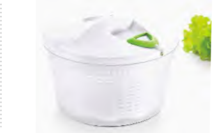
ART NO:D655 SALAD SPINNER SIZE:Φ27xH18cm MEAS/QTY:28.5x52.5x57cm/6pcs GW/NW:6.2/4.4kgs 20'/40':2256/4848pcs