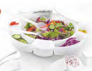
ART NO:R401 19PIECES JUMBO SALAD BOWL MEAS/QTY:62x35.5x47cm/12set GW/NW:14/12kgs 20'/40':3408/6828set