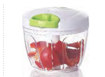
ART NO:A371 MINI SLICER MEAS/QTY:40.5x40.5x53.5cm/36pcs GW/NW:11.7/8kgs 20'/40':11520/23832pcs