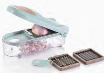
■ ART NO:B459 MULTI-SLICER MEAS/QTY:43.8x36x58cm/24set GW/NW:17.5/14kgs 20'/40':7680/15552set