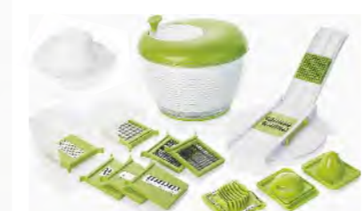
■ ART NO:DF1420 FOOD PROCESSOR MEAS/QTY:50.5x28.5x52.5cm/4set GW/NW:9/7.4kgs 20'/40':1404/2812set