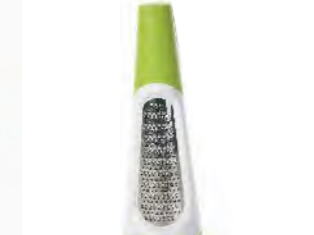
ART NO:BF1375 MULTI GRATER MEAS/QTY:35.5x27.5x56cm/18pcs GW/NW:6.3/5.3kgs 20'/40':12312/25464pcs