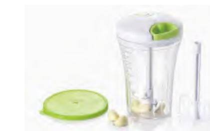
ART NO:A366 CHOPPER AND BLENDER SET MEAS/QTY:55.5x42x62cm/36set GW/NW:12.4/10.4kgs 20'/40':6876/14220set