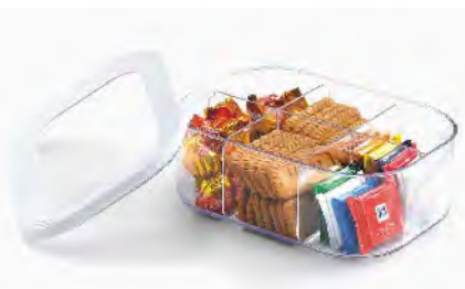
ART NO:S455 FRIDGE STORAGE BOX MEAS/QTY:46.5x33.5x52.5cm/24set GW/NW:11.4/9.4kgs 20'/40':8016/16056set