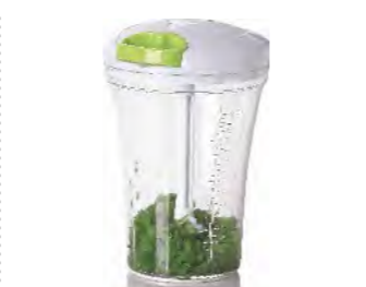
ART NO:A365 QUICK PULL CHOPPER MEAS/QTY:55.5x42x62cm/36pcs GW/NW:12.4/9.4kgs 20'/40':6876/14220pcs