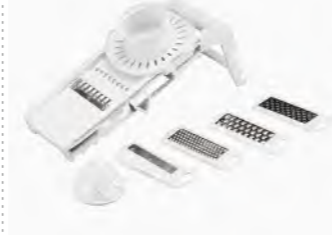
ART NO:BF1300 JUMBO GRATER MEAS/QTY:57.5x34x45.5cm/12set GW/NW:9.4/8.4kgs 20'/40':3768/7824set