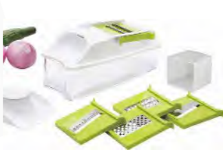
ART NO:BF1403-01 FOOD PROCESSOR MEAS/QTY:60.5x40x28cm/12set GW/NW:10.7/9.7kgs 20'/40':4956/10260set