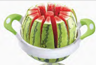
ART NO:B476 MELON CUTTER SIZE:Φ28xH7cm MEAS/QTY:58.5x24x70.5cm/12set GW/NW:11.7/7.5kgs 20'/40':3444/6900set