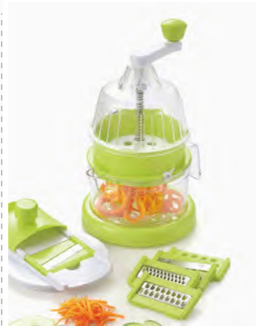
■ ART NO:B207-C SPIRAL SLICER SET MEAS/QTY:36.5x33.5x59cm/12set GW/NW:9.74/7.6kgs 20'/40':4392/9648set