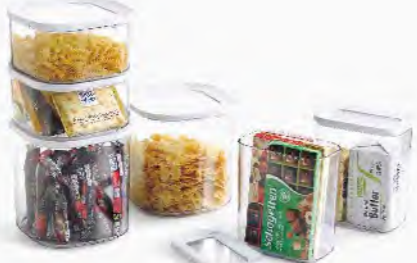
ART NO:Z867 6SETS FRIDGE STORAGE BOX MEAS/QTY:52x35.7x76.6cm/6set GW/NW:11.3/9.3kgs 20'/40':1218/2442set