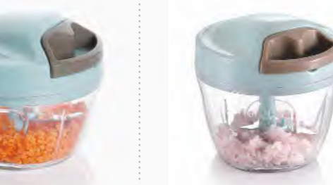
ART NO:A388 QUICK PULL CHOPPER(400ML) MEAS/QTY:53.8x35.5x41cm/36pcs GW/NW:7.5/5kgs 20'/40':9936/20880pcs