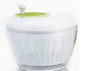
■ ART NO:DF1420-01 SALAD SPINNER MEAS/QTY:50.5x25.5x54.5cm/6pcs GW/NW:6.7/4.7kgs 20'/40':2586/4962pcs