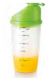
■ ART NO:U952 OIL DISPENSER MEAS/QTY:64x38x45.5cm/48set GW/NW:9.3/8.3kgs 20'/40':12672/25392set