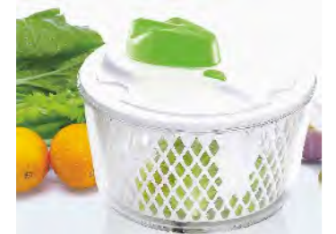
ART NO:D657 SALAD SPINNER SIZE:Φ26xH19.1cm MEAS/QTY:54x27.3x53cm/6pcs GW/NW:7.6/5kgs 20'/40':2106/4218pcs