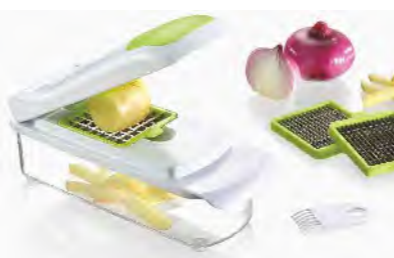
■ ART NO:B427 MULTI-SLICER MEAS/QTY:47.5x37.5x63cm/24set GW/NW:19.8/16.6kgs 20'/40':6024/12072set