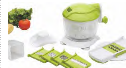
■ ART NO:DF1405-02 FOOD PROCESSOR MEAS/QTY:57.5x46.5x44.5cm/8set GW/NW:12.6/11.6kgs 20'/40':1880/3896set