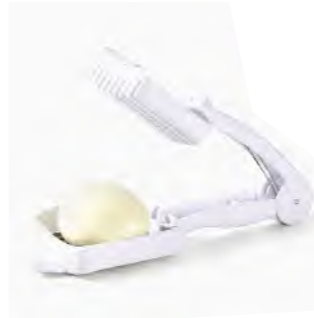
■ ART NO:F402 MUSHROOM SLICER MEAS/QTY:37x33.5x46.5cm/48set GW/NW:6.5/3.6kgs 20'/40':22176/46944set