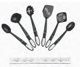
ART NO:X550 7 IN 1 KITCHEN TOOLS SET MEAS/QTY:58.5x41.5x31.5cm/12set GW/NW:9.5/8kgs 20'/40':4380/8760set