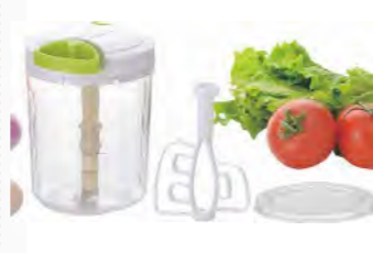
■ ART NO:AF1416-01 MINI CHOPPER MEAS/QTY:54x40.5x54cm/36set GW/NW:20/19kgs 20'/40':8532/17676set