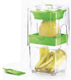
■ ART NO:B411 POTATO/ONION CUTTER MEAS/QTY:50.5x33x50cm/36set GW/NW:19.8/16.4kgs 20'/40':11196/23292set