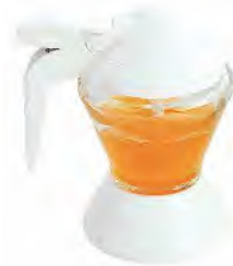
ART NO:H925 HONEY DISPENSER MEAS/QTY:41x31x45.5cm/36set GW/NW:7.5/5.5kgs 20'/40':18324/36684set