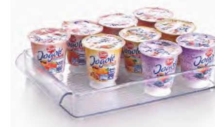
ART NO:S466 FRIDGE STORAGE BOX MEAS/QTY:42.5x31x43cm/18pcs GW/NW:7.8/5.8kgs 20'/40':8190/17280pcs