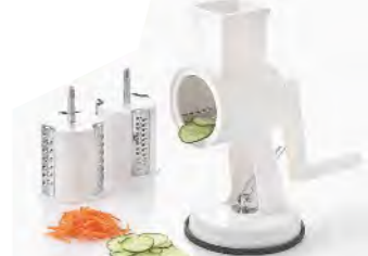
ART NO:B351-A DRUM GRATER (3PCS BLADES INCLUDED) MEAS/QTY:51.5x40.5x60.5cm/24set GW/NW:16/15kgs 20'/40':5088/10824set