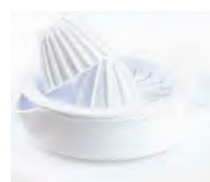
■ ART NO:C386 JUICE EXTRACTOR MEAS/QTY:53.5x33x58.5cm/36set GW/NW:10/8.3kgs 20'/40':9540/19116set