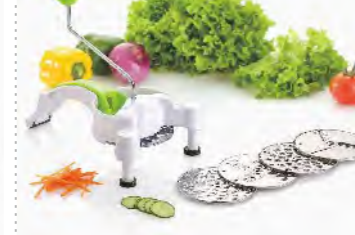
ART NO:B830 ROTARY GRATER WITH 5 DISKS MEAS/QTY:43.8x29.5x57.5cm/6set GW/NW:7.1/5.1kgs 20'/40':4644/9300set