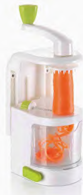
■ ART NO:B450 SPIRAL SLICER MEAS/QTY:49.8x31.5x53cm/24set GW/NW:18.3/15.5kgs 20'/40':8160/16800set