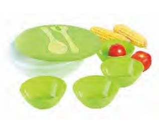
ART NO:R664-A SALAD BOWL MEAS/QTY:54x29x65cm/12set GW/NW:5.9/4.7kgs 20'/40':3252/6516set