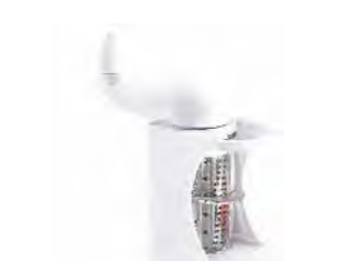
ART NO:B430 MINI GRATER MEAS/QTY:38.5x31x58cm/72set GW/NW:13.7/9.2kgs 20'/40':31068/60408set