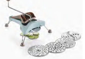
ART NO:B828 MULTI-GRATER (5PCS BLADES INCLUDED) MEAS/QTY:31x25.5x57.5cm/12set GW/NW:8.1/5.1kgs 20'/40':7680/15744set