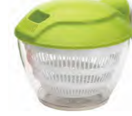
■ ART NO:DF1407-01 SALAD SPINNER MEAS/QTY:51.5x51.5x47.5cm/8pcs GW/NW:10.8/9.8kgs 20'/40':1776/3680pcs