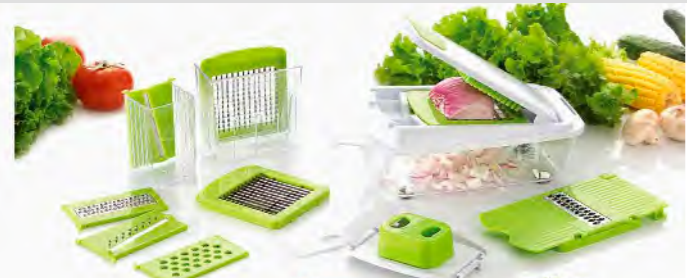
■ ART NO:B413-A MULTI KITCHEN GRATER MEAS/QTY:43.8x27x58.5cm/12set GW/NW:14.7/12.7kgs 20'/40':4848/10008set