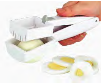
■ ART NO:F402-A MUSHROOM SLICER MEAS/QTY:38.7x40.8x51cm/144set GW/NW:15/13kgs 20'/40':41328/82800set