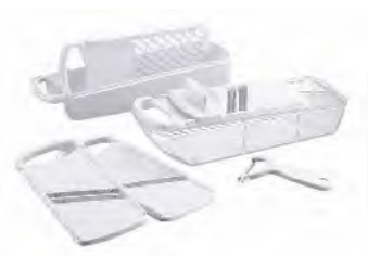
ART NO:BF1131 KITCHEN GRATER MEAS/QTY:43.5x34.5x63cm/24set GW/NW:18/17kgs 20'/40':7128/14808set