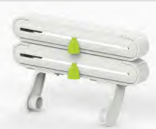
ART NO:K379 KITCHEN DISPENSER MEAS/QTY:58.5x40x56.5cm/24set GW/NW:14.8/10.3kgs 20'/40':4992/10464set