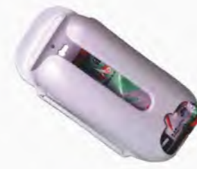
ART NO:H608 BAG SAFER MEAS/QTY:56.5x31x47.5cm/24pcs GW/NW:6.1/5.1kgs 20'/40':8616/17256set