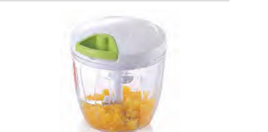
ART NO:A373-B QUICK PULL CHOPPER(900ML) MEAS/QTY:53.5x40x45.5cm/36pcs GW/NW:13.2/9.7kgs 20'/40':10440/22320pcs