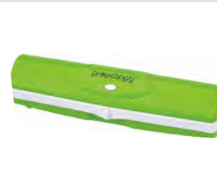
ART NO:KF1386 WRAP DISPENSER MEAS/QTY:41x36x36.5cm/16set GW/NW:6.5/5.5kgs 20'/40':8288/17184set