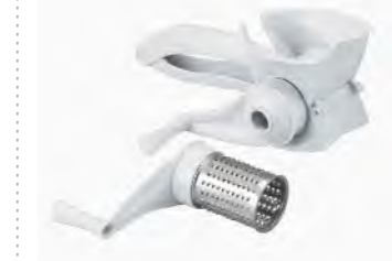
ART NO:BF1096-01 MINI GRATER MEAS/QTY:45.5x42x53cm/30set GW/NW:7/6kgs 20'/40':8280/17160set