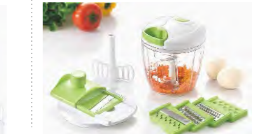
ART NO:A370-A QUICK PULL CHOPPER SET MEAS/QTY:45x29.5x54.5cm/18set GW/NW:10.5/7.8kgs 20'/40':6840/14040set