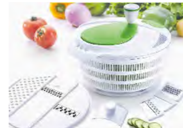
ART NO:D668-A MULTI-FUNCTIONAL SALAD SPINNER MEAS/QTY:51.6x28.7x57cm/6set GW/NW:12.4/10.4kgs 20'/40':2106/4218set