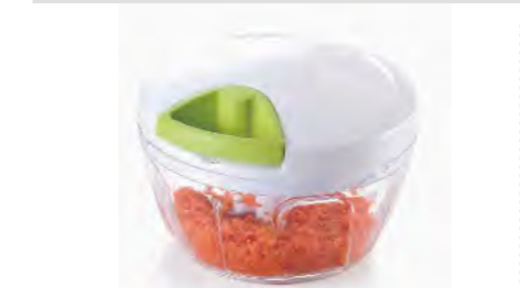
ART NO:A373 QUICK PULL CHOPPER(400ML) MEAS/QTY:53.8x31x41cm/36pcs GW/NW:10.2/7.1kgs 20'/40':14688/29412pcs