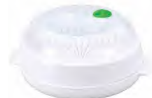
ART NO:S980 MICROWAVE BOX MEAS/QTY:44x34x66.5cm/24pcs GW/NW:10/7.2kgs 20'/40':6528/13056set