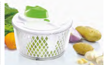
ART NO:D658 SALAD SPINNER SIZE:Φ20.7xH16cm MEAS/QTY:43.7x43.7x47cm/12pcs GW/NW:9/7kgs 20'/40':3708/7428pcs