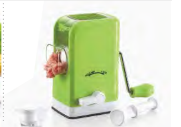
■ ART NO:A470 WONDER MINCER MEAS/QTY:54.5x26.3x49cm/12set GW/NW:14.5/12.5kgs 20'/40':4560/9600set