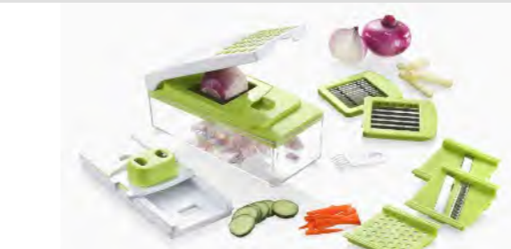
■ ART NO:B428-A MULTI KITCHEN GRATER MEAS/QTY:42x25x57cm/12set GW/NW:14.6/12.6kgs 20'/40':5604/11652set