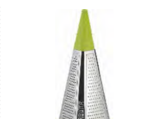
ART NO:BF1335 ONION/VEGETABLE BICER MEAS/QTY:58x33x39cm/24pcs GW/NW:12/10.5kgs 20'/40':9000/18648pcs