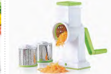
ART NO:B366-B DRUM GRATER (3PCS BLADES INCLUDED) MEAS/QTY:48x31.5x54cm/12set GW/NW:8.8/6.2kgs 20'/40':4040/8100set