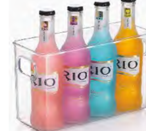
ART NO:S460 FRIDGE STORAGE BOX MEAS/QTY:51.5x26.5x58.5cm/20pcs GW/NW:7.7/6.6kgs 20'/40':7140/14320pcs