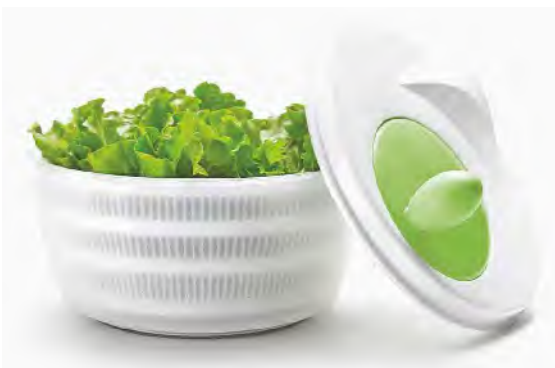
■ ART NO:D644 SALAD SPINNER SIZE:Φ24.5xH19cm MEAS/QTY:50.5x43.5x50.8cm/12pcs GW/NW:7.2/5.7kgs 20'/40':3060/6120pcs