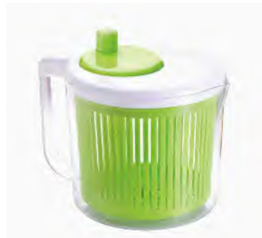
ART NO:D928 SALAD SPINNER MEAS/QTY:38.5x35.5x56cm/12pcs GW/NW:6.9/4.9kgs 20'/40':4596/9204pcs