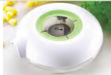
ART NO:G230 CORN HELPER MEAS/QTY:49.5x40x29cm/54set GW/NW:9/7.4kgs 20'/40':27594/55242set