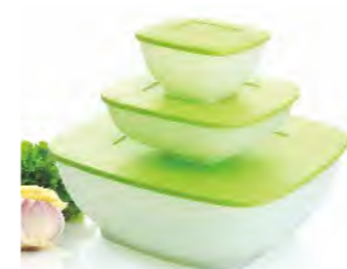
ART NO:R404 6PCS STORAGE SET MEAS/QTY:61x32.5x35.5cm/6pcs GW/NW:6.6/5.7kgs 20'/40':2388/4776set