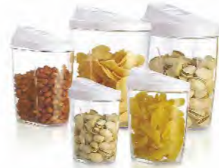
ART NO:H360 5 PIECES STORAGE BOX MEAS/QTY:47.5x38.3x63.5cm/36set GW/NW:22.5/18kgs 20'/40':9036/18108set