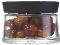
ART NO:H806 PLASTIC JAR MEAS/QTY:35.7x28x47.6cm/36pcs GW/NW:10.1/8.1kgs 20'/40':21852/43740pcs