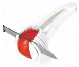
■ ART NO:F883 SLICER HELPER MEAS/QTY:36.5x29x39.5cm/48set GW/NW:4.5/3kgs 20'/40':31392/65952set