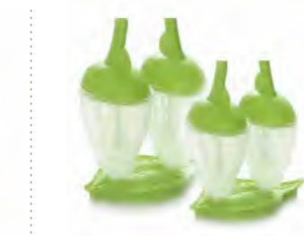
■ ART NO:T156 4PCS GROOVY POPSICLE MAKER MEAS/QTY:60x46.5x51.5cm/48set GW/NW:8.2/6.2kgs 20'/40':9552/19152set