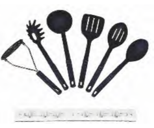
ART NO:X427 7 IN 1 KITCHEN TOOLS SET MEAS/QTY:49.5x41.5x50cm/24set GW/NW:12/11kgs 20'/40':6528/13536set