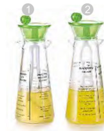
■ ART NO:U954/U950 MIXER BOTTLE MEAS/QTY:48x32.5x46cm/48pcs GW/NW:10/6.6kgs 20'/40':20112/40272pcs