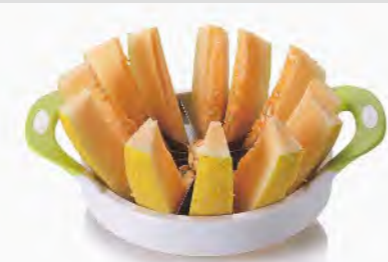
ART NO:B475 MELON CUTTER SIZE:Φ22xH6.2cm MEAS/QTY:47x45.5x65cm/24set GW/NW:16.6/12.2kgs 20'/40':4776/9576set