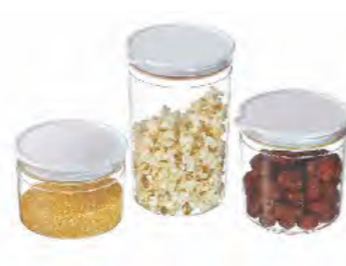
ART NO:H463 3 PIECES STORAGE BOX MEAS/QTY:46x46x65.5cm/24set GW/NW:18/14.4kgs 20'/40':4776/9576set