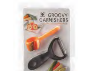
■ ART NO:G517 GROOVY GARNISHERS MEAS/QTY:56.5x43.5x42.5cm/48set GW/NW:9/7kgs 20'/40':12432/25872set