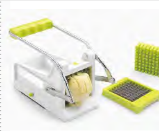
■ ART NO:BF1029 POTATO/VEGETABLE CHIPPER MEAS/QTY:52.5x30x38cm/12set GW/NW:13.5/12kgs 20'/40':5616/8040set