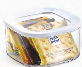
ART NO:S453 FRIDGE STORAGE BOX MEAS/QTY:49.5x33.5x35cm/24set GW/NW:7.3/5.3kgs 20'/40':11208/22440set