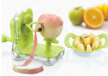
ART NO:Z856 APPLE HELPER SET MEAS/QTY:57.5x27.3x58cm/18set GW/NW:12.6/9.5kgs 20'/40':5760/12096set