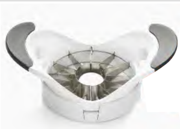
ART NO:B477 PEACH CUTTER MEAS/QTY:68.7x34.8x51.6cm/96set GW/NW:14.2/12.2kgs 20'/40':18432/36864set