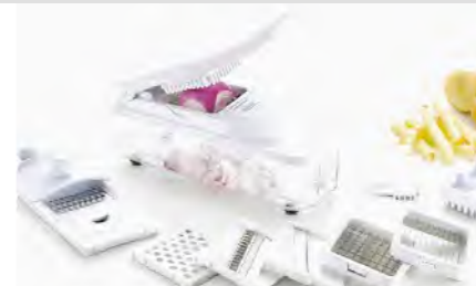
■ ART NO:B410-A MULTI KITCHEN PLUS MEAS/QTY:59.5x36x56cm/24set GW/NW:26.6/22.9kgs 20'/40':5640/11304set