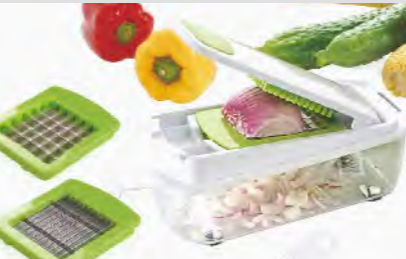
■ ART NO:B413-F MULTI CUTTER MEAS/QTY:59x30x65.5cm/24set GW/NW:18/14kgs 20'/40':6120/11376set