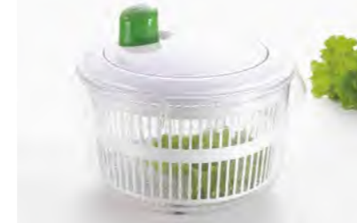
ART NO:D656-A SALAD SPINNER SIZE:Φ25xH16.5cm MEAS/QTY:52.5x54x28.5cm/6pcs GW/NW:6.8/4.4kgs 20'/40':2100/4350pcs