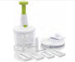
■ ART NO:AF1425 SALAD MAKER MEAS/QTY:52.5x35.5x62cm/18set GW/NW:16.5/15.5kgs 20'/40':4356/9036set