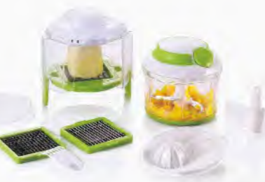
■ ART NO:A362 MULTI FUNCTIONAL KITCHEN HELPER MEAS/QTY:48x32.5x54cm/12set GW/NW:13.2/11.2kgs 20'/40':4020/8052set