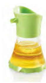
■ ART NO:U958 OIL AND VINEGAR DISPENSER MEAS/QTY:41.5x35.1x48.5cm/36set GW/NW:8/6kgs 20'/40':16596/33228set