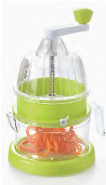
■ ART NO:B207-B SPIRAL SLICER WITH SUCTION BASE MEAS/QTY:49.5x33.5x55cm/18set GW/NW:11.3/8.6kgs 20'/40':5400/11448set