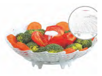
ART NO:T234 VEGETALE STEAMER MEAS/QTY:56.5x43.2x58.1cm/96pcs GW/NW:11/9kgs 20'/40':19872/39840pcs