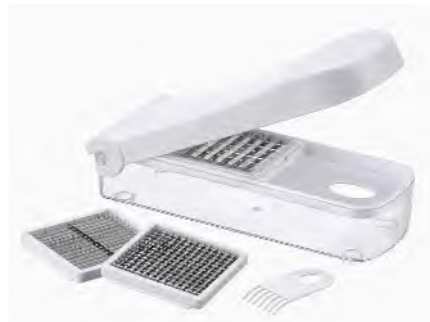
■ ART NO:BF1282 ONION/VEGETABLE DICER AND CUTTER MEAS/QTY:58x25.5x51.5cm/24set GW/NW:12/10.5kgs 20'/40':8808/18264set