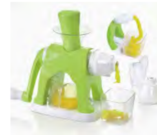
■ ART NO:A471 ICE CREAM&JUICER MAKER MEAS/QTY:47.5x33.5x73cm/12set GW/NW:18.3/14.8kgs 20'/40':2940/5892set