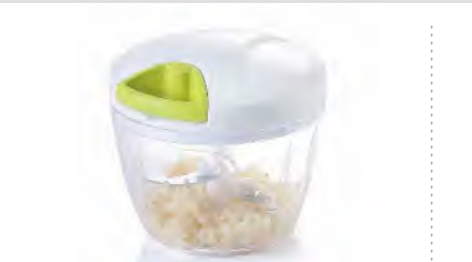
ART NO:A373-A QUICK PULL CHOPPER(650ML) MEAS/QTY:40.5x40.5x53.5cm/36pcs GW/NW:11.7/8kgs 20'/40':11520/23832pcs