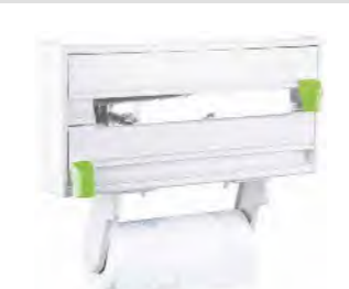
ART NO:K429 3 IN 1 KITCHEN DISPENSER MEAS/QTY:60x36.5x43cm/12set GW/NW:10.8/7.5kgs 20'/40':3516/7044set