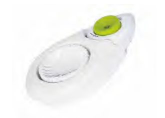
■ ART NO:FF1038 EGG/MUSHROOM SLICER W/PIERCER MEAS/QTY:34.5x20x44cm/48pcs GW/NW:7.8/6.8kgs 20'/40':44256/91680pcs