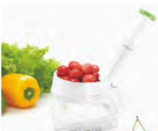
ART NO:Y527 CHERRY&GRAPE CORER MEAS/QTY:53.8x38.5x47cm/24set GW/NW:9/8kgs 20'/40':6888/13800set