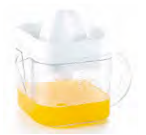
■ ART NO:C604 JUICE EXTRACTOR MEAS/QTY:37.2x33x57.5cm/24set GW/NW:5.6/4.1kgs 20'/40':10056/20136set