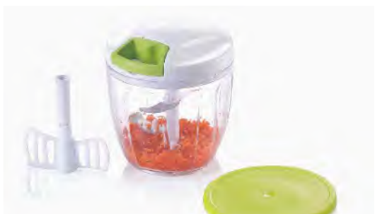
ART NO:A372-B QUICK PULL CHOPPER(900ML) MEAS/QTY:53.5x40x45.5cm/36pcs GW/NW:13.2/9.9kgs 20'/40':10440/22320pcs