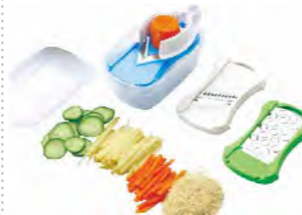
ART NO:B929 MULTI WONDER GRATER MEAS/QTY:45x37.8x56cm/72set GW/NW:14/9.6kgs 20'/40':21528/43128set