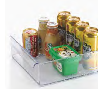
ART NO:S463 FRIDGE STORAGE BOX MEAS/QTY:60.5x31x41.5cm/8pcs GW/NW:7.2/5.2kgs 20'/40':2744/5824pcs