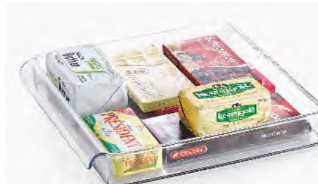
ART NO:S464 FRIDGE STORAGE BOX MEAS/QTY:31.5x31x57cm/12pcs GW/NW:7.7/5.7kgs 20'/40':6024/12408pcs