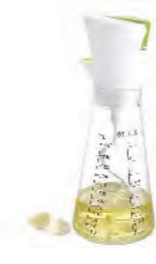
■ ART NO:U960 MIXER BOTTLE MEAS/QTY:35x35x64cm/48set GW/NW:9.6/6.3kgs 20'/40':16080/32208set