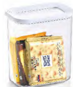
ART NO:S454 FRIDGE STORAGE BOX(1500ML) MEAS/QTY:45x37.5x51.3cm/36set GW/NW:10/8kgs 20'/40':12060/24156set