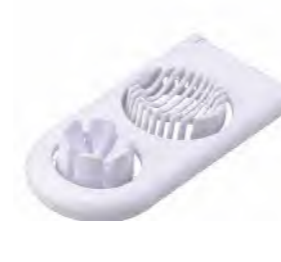
■ ART NO:FF704-01 EGG SLICER MEAS/QTY:61x30x22.5cm/36set GW/NW:6.6/5.6kgs 20'/40':24480/50688set