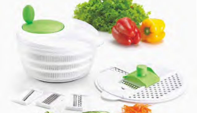
■ ART NO:D644-A MULTI-FUNCTIONAL SALAD SPINNER SIZE:Φ24.2xH19cm MEAS/QTY:55x28.2x48cm/6set GW/NW:6/4.5kgs 20'/40':2298/4602set