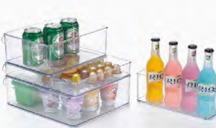
ART NO:Z861 FRIDGE STORAGE BOX MEAS/QTY:63x32.3x53.6cm/4set GW/NW:9.7/7.7kgs 20'/40':1060/2124set