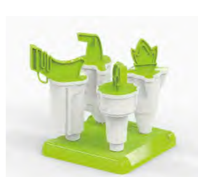
■ ART NO:T159 4 PCS POPSICLE MAKER MEAS/QTY:60x45x53cm/36set GW/NW:9.9/5.1kgs 20'/40':7128/14760set