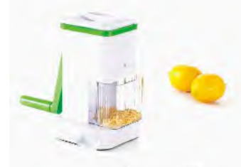
ART NO:B820 CHEESE GRATER MEAS/QTY:43x26.3x68cm/18pcs GW/NW:13/11.8kgs 20'/40':6372/13302pcs