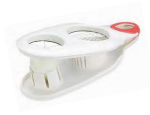
■ ART NO:FF704-02 EGG SLICER MEAS/QTY:74x36.5x38.5cm/72pcs GW/NW:19.3/18.3kgs 20'/40':19368/40404pcs