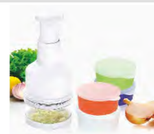
■ ART NO:E255 MULTI VEGETABLE CHOPPER MEAS/QTY:64.5x39x53cm/24set GW/NW:13.1/8kgs 20'/40':5304/10632set