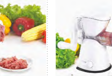
■ ART NO:A489 WONDER MINCER MEAS/QTY:48x37.7x56.3cm/12set GW/NW:21/19kgs 20'/40':3444/6900set