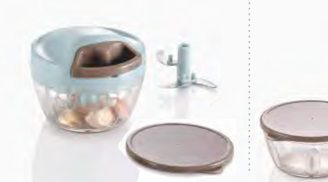
ART NO:A388-C QUICK PULL CHOPPER(400ML) MEAS/QTY:53.8x35.5x41cm/36set GW/NW:8.9/6.4kgs 20'/40':9936/20880set