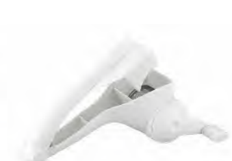
ART NO:BF1096-02 MINI MULTI GRATER 3 IN 1 MEAS/QTY:45x22.5x35cm/12set GW/NW:8/7kgs 20'/40':9480/19632set