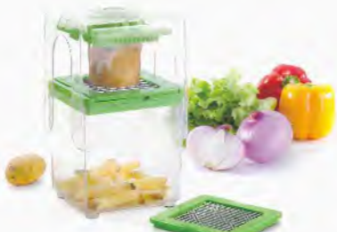
■ ART NO:B425 POTATO/ONION CUTTER MEAS/QTY:45.8x39.2x54.5cm/24set GW/NW:17.5/15.5kgs 20'/40':6936/13896set