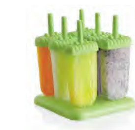
■ ART NO:T151 6PCS GROOVY POPSICLE MAKER MEAS/QTY:43.8x31.5x51cm/24set GW/NW:6.4/3.9kgs 20'/40':9240/19320set