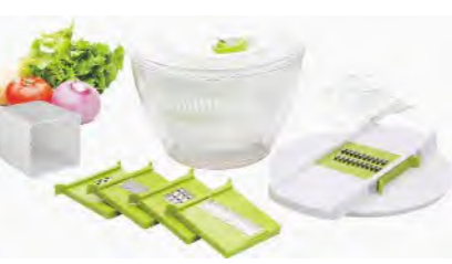
■ ART NO:DF1404-02 FOOD PROCESSOR MEAS/QTY:56.5x52.5x45cm/8set GW/NW:14.5/13.5kgs 20'/40':1672/3472set