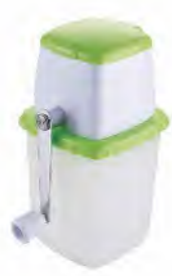
■ ART NO:T819 ICE CRUSHER MEAS/QTY:37.5x34x49.5cm/12set GW/NW:8.7/6.4kgs 20'/40':5676/11364set