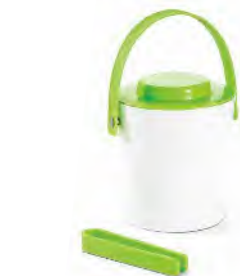
■ ART NO:T240 ICE PAIL MEAS/QTY:44.5x31x46.5cm/18set GW/NW:5.5/4.5kgs 20'/40':7560/15750set