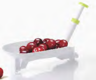
ART NO:Y528 CHERRY&GRAPE CORER MEAS/QTY:66x27x54.5cm/12set GW/NW:3.7/2.2kgs 20'/40':3300/6612set