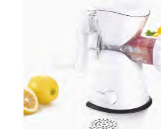
■ ART NO:A489-A WONDER MINCER MEAS/QTY:57x28.7x47cm/12set GW/NW:15.1/12.4kgs 20'/40':4596/9204set