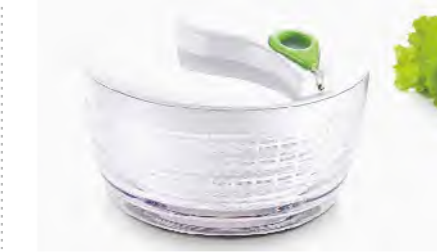
ART NO:D420 SALAD SPINNER SIZE:Φ26.5xH18cm MEAS/QTY:55.5x35.5x56.4cm/8pcs GW/NW:8.7/5.7kgs 20'/40':2104/4216pcs