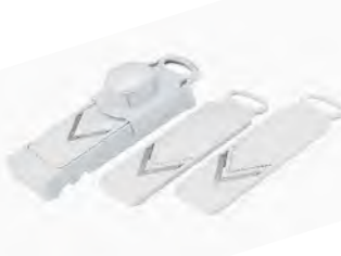
ART NO:BF1042 KITCHEN GRATER MEAS/QTY:47x40x41cm/24set GW/NW:16/15kgs 20'/40':8712/18048set