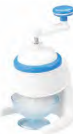
■ ART NO:TF1186 ICE SHAVER MEAS/QTY:59.5x38x69cm/24set GW/NW:14/12.5kgs 20'/40':4296/8904set