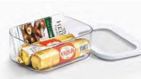
ART NO:S455-A FRIDGE STORAGE BOX(2000ML) MEAS/QTY:46.5x33.5x52.5cm/24set GW/NW:9.5/7.5kgs 20'/40':8016/16056set