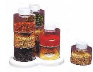
ART NO:H362 9 PCS SWIVEL STORAGE SET MEAS/QTY:45x23x59cm/12set GW/NW:6.8/5kgs 20'/40':5388/10788set