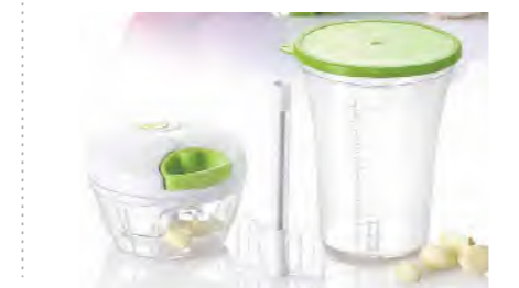
ART NO:A366-A CHOPPER AND BLENDER SET MEAS/QTY:42x28.5x46.4cm/12set GW/NW:5.8/4.3kgs 20'/40':6228/12468set