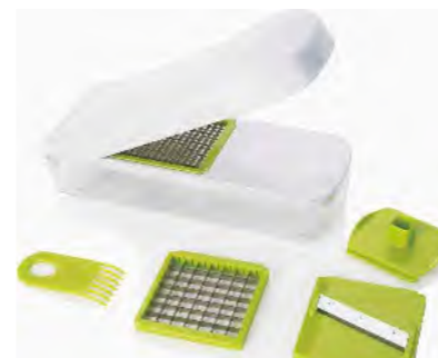
■ ART NO:BF1282-02 ONION/VEGETABLE DICER AND CUTTER MEAS/QTY:58x25.5x51.5cm/24set GW/NW:12/10.5kgs 20'/40':8808/18264set