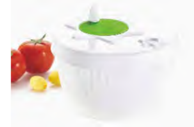
ART NO:D886 MINI SALAD SPINNER SIZE:Φ19xH15.5cm MEAS/QTY:40.7x51.5x60.3cm/18pcs GW/NW:5/3.5kgs 20'/40':4032/8208pcs