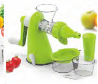
■ ART NO:B452-A MANUL JUICER MEAS/QTY:51.5x39x60cm/12set GW/NW:16.8/13.3kgs 20'/40':2820/5880set