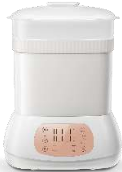
Baby Bottle Sterilizer