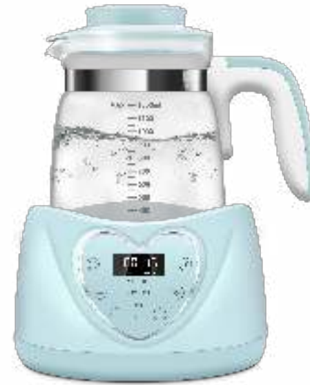
Baby Formula Kettle