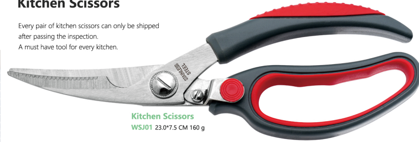
Kitchen Scissors WSJ01 23.0*7.5 CM 160 g

Every pair of kitchen scissors can only be shipped after passing the inspection. A must have tool for every kitchen.