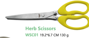
Herb Scissors WSC01 19.2*6.7 CM 130 g