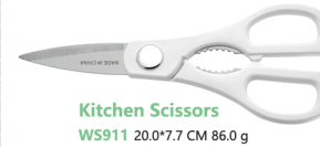
Kitchen Scissors WS911 20.0*7.7 CM 86.0 g