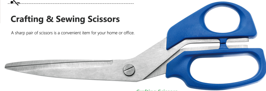
Crafting Scissors WSJ03 22.5*7.7 CM 140 g

A sharp pair of scissors is a convenient item for your home or office.