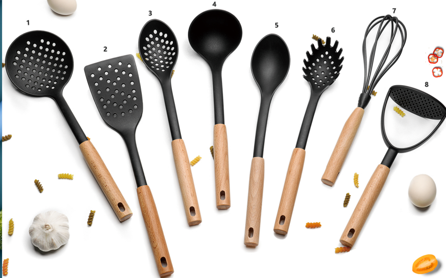
1 Nylon Skimmer WH01-SK 36.4*11.0 CM 77.7 g