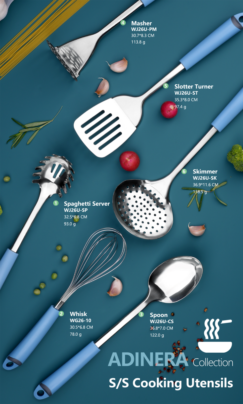
4 Masher WJ26U-PM 30.7*8.3 CM 113.8 g